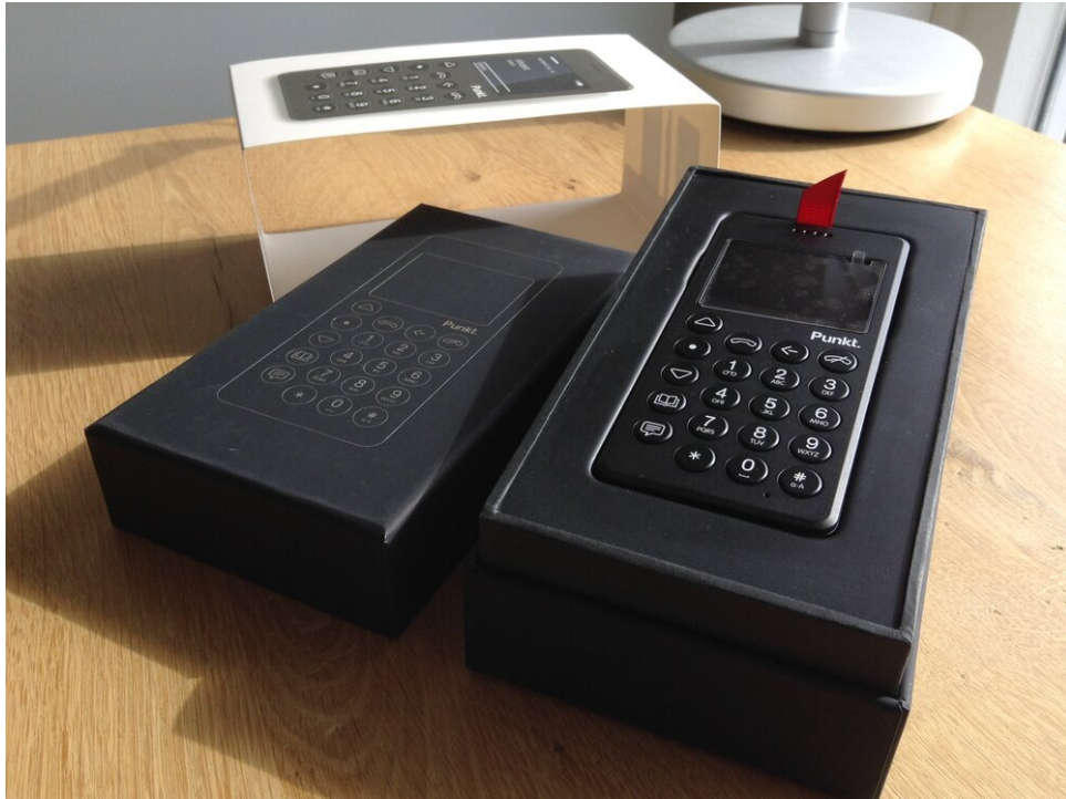
The Punkt MP01 dumb phone

It comes in a big box with a booklet, charger, SIM-tool and a headset.