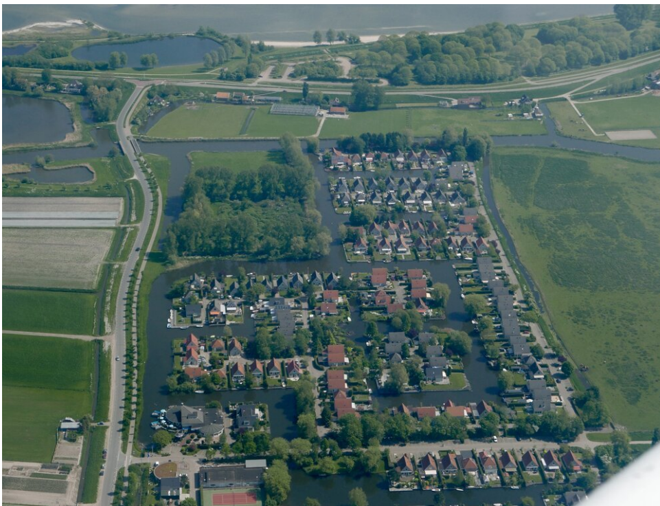
De Vlietlanden near Medemblik