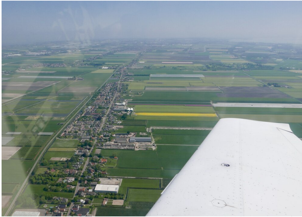
Middelie, with some colourful flower fields