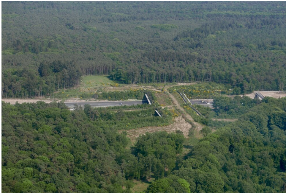
Ecoduct "Natuurbrug Zwaluwenberg" over the A27 near Hilversum