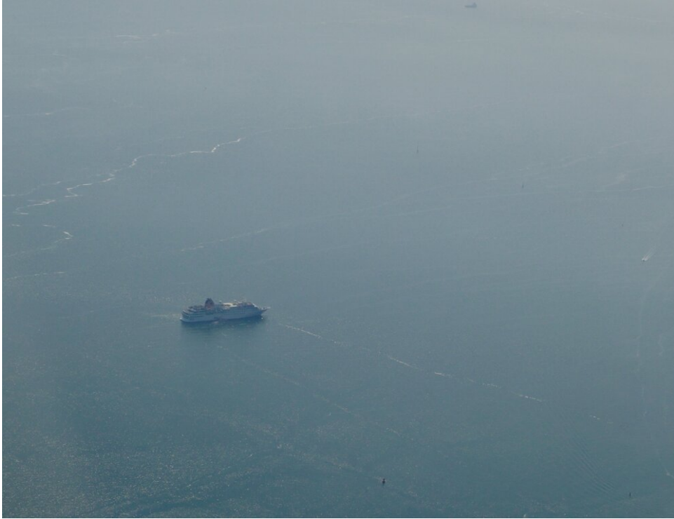
Passengership in de Waddenzee (near Texel)