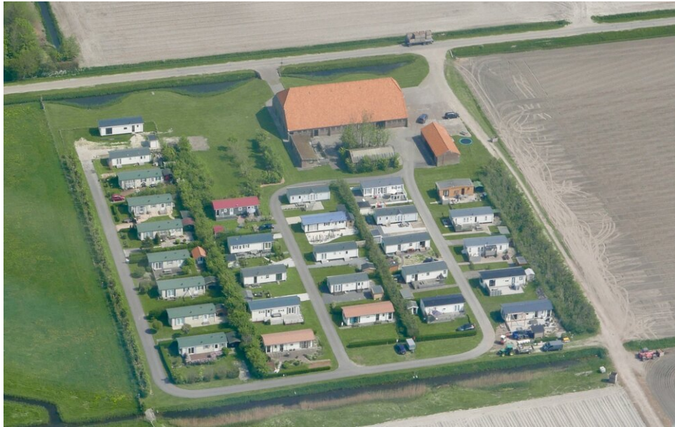
Chalets seen from above at Jachtlust Recreatie, Slufterweg 380, Texel