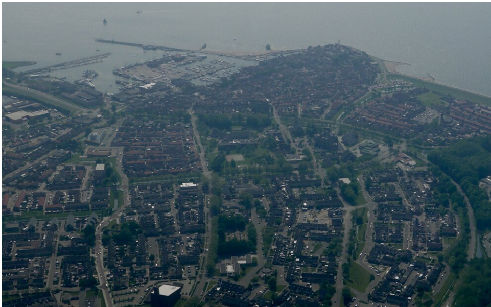
Urk, the former Island in de Zuiderzee