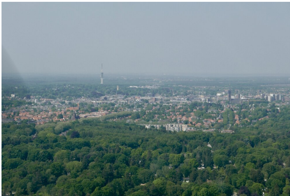
Hilversum - with the radio/TV tower clearly visible