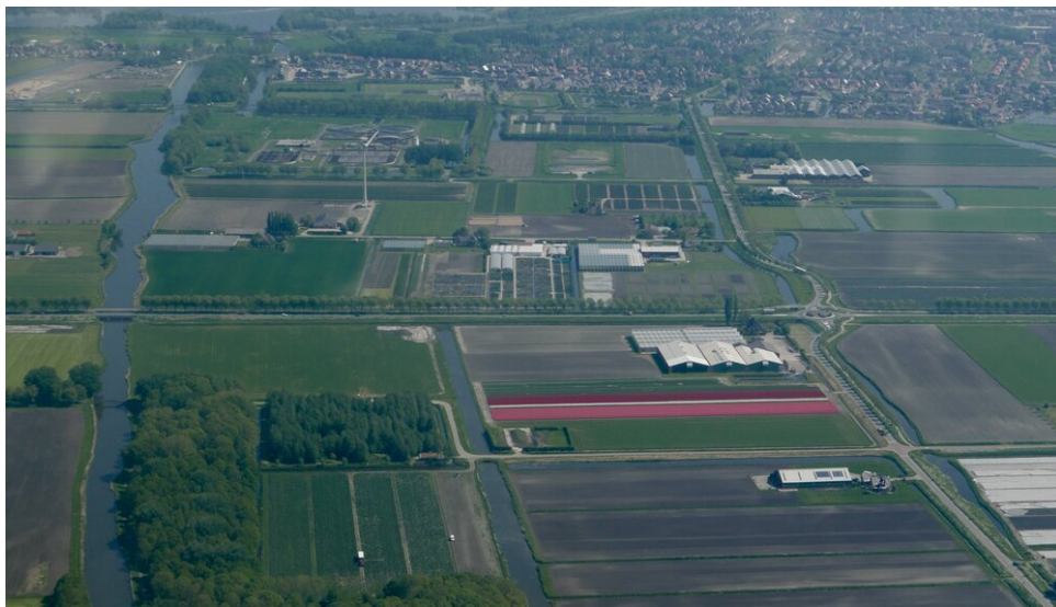
Fields with flowers can easily be seen from above!