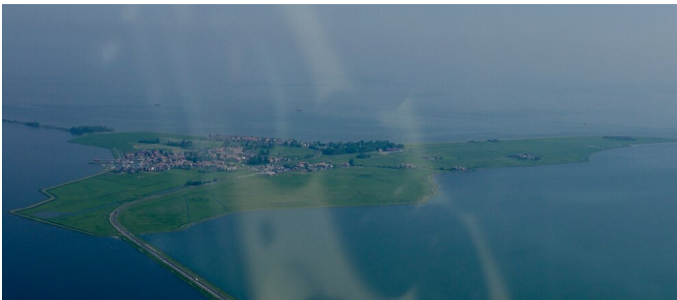
Marken, former Island in the Zuiderzee