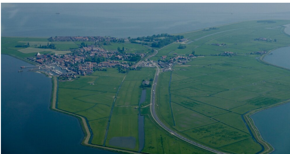
Marken from the west