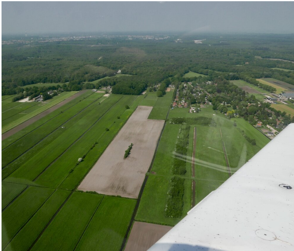
Egelshoek, near Hilversum