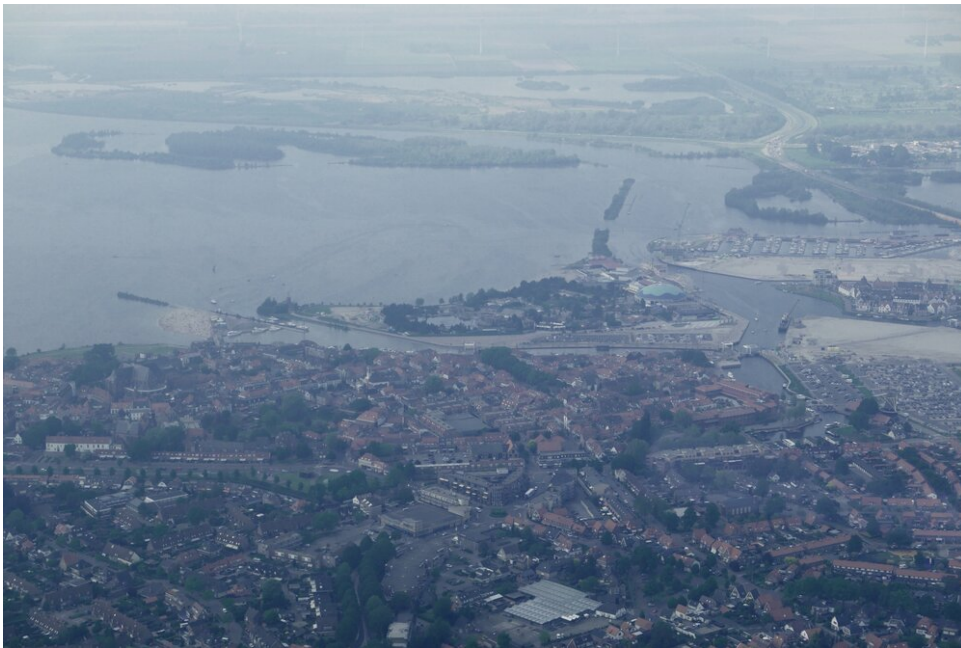
Dolfinarium Hardewijk (the blue dome in the center)