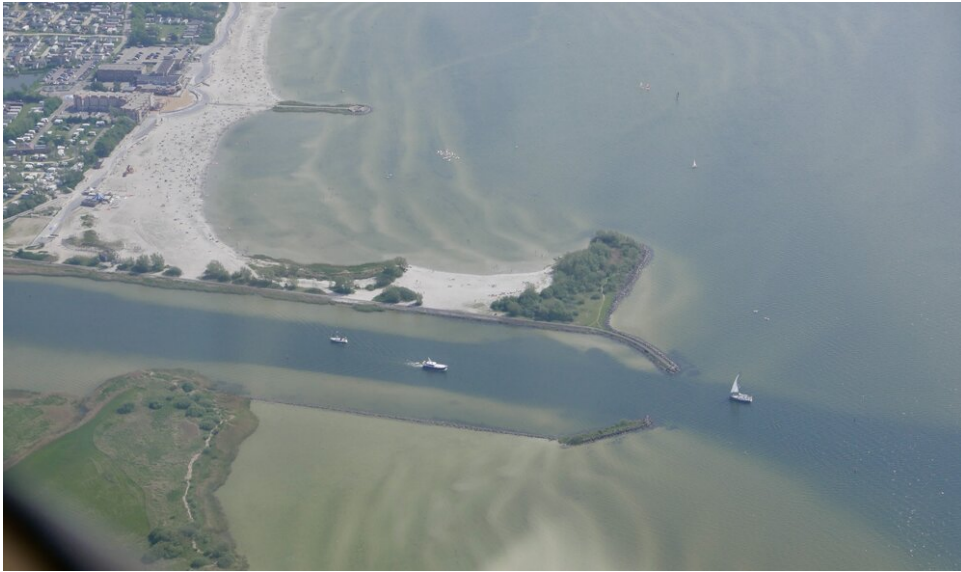
Makkumerdiep and Makkum beach, you can clearly see the differences in water depth from the sky