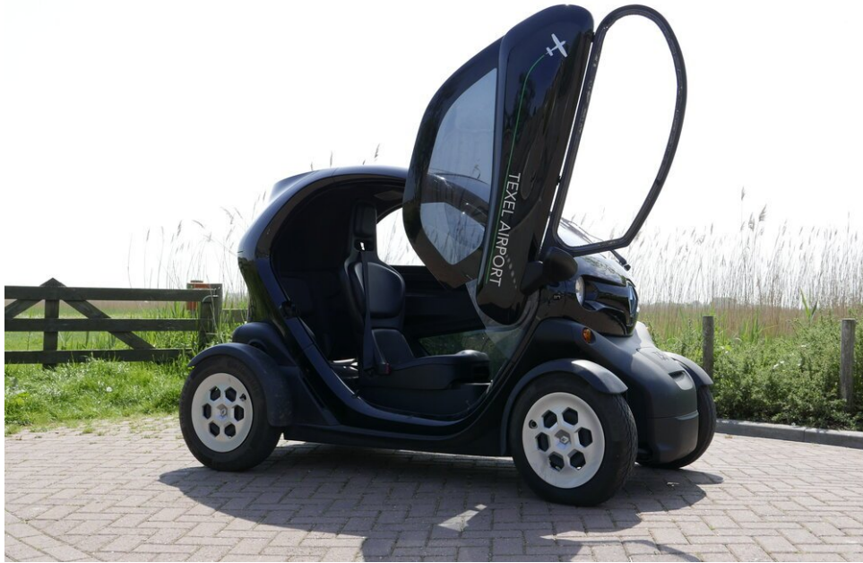
Renault Twizy from Texel Airport

It's really weird to be able to travel so quickly by plane, no customs, no security check, no waiting lines. It's really unlike commercial flights. It's really feels like hopping in, taking off. After lunch we took off again for our return flight.