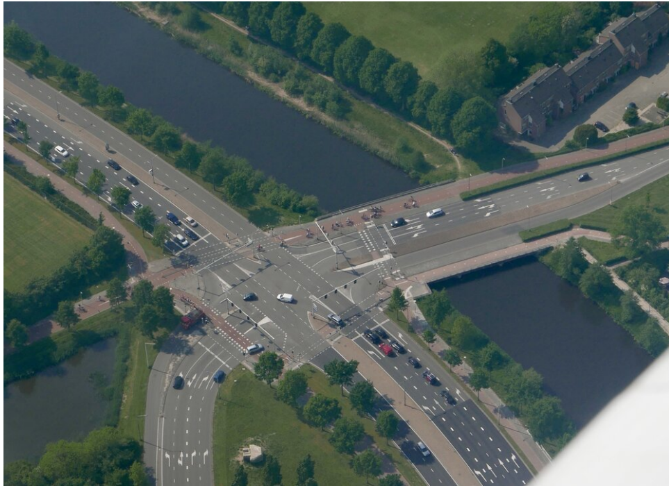
Bridge over Valleikanaal, near junction Holkerweg / Ringweg Koppel in Amertsfoort