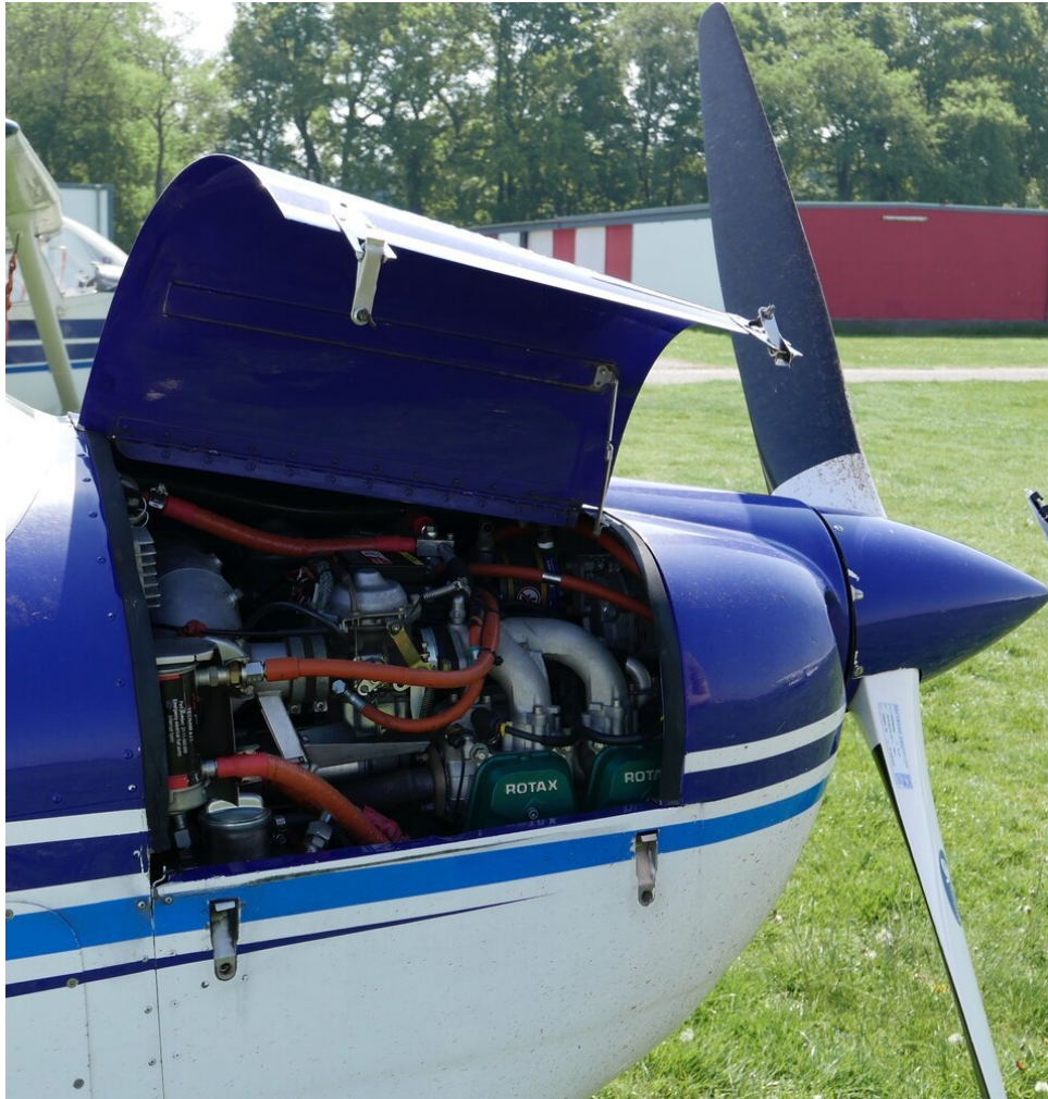
Rotax 912S2 engine with 100HP

The plane is powered by a Rotax 912S2 engine with 100HP. It's a four-cylinder, four-stroke liquid / air-cooled engine that weighs about 60KG. It's fueled with normal car fuel, quite practical.