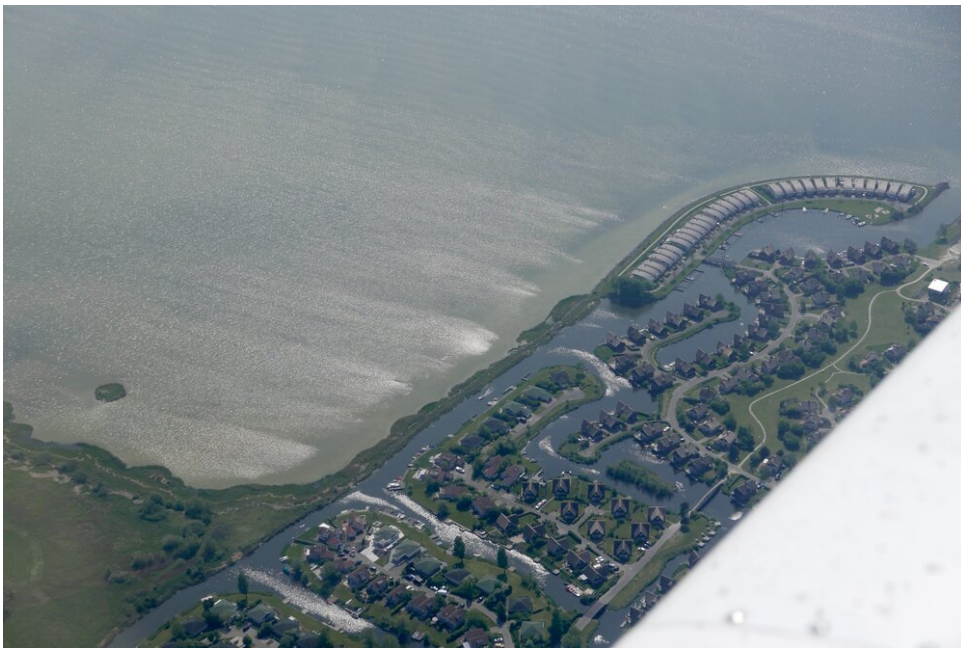
Beach Resort Makkum