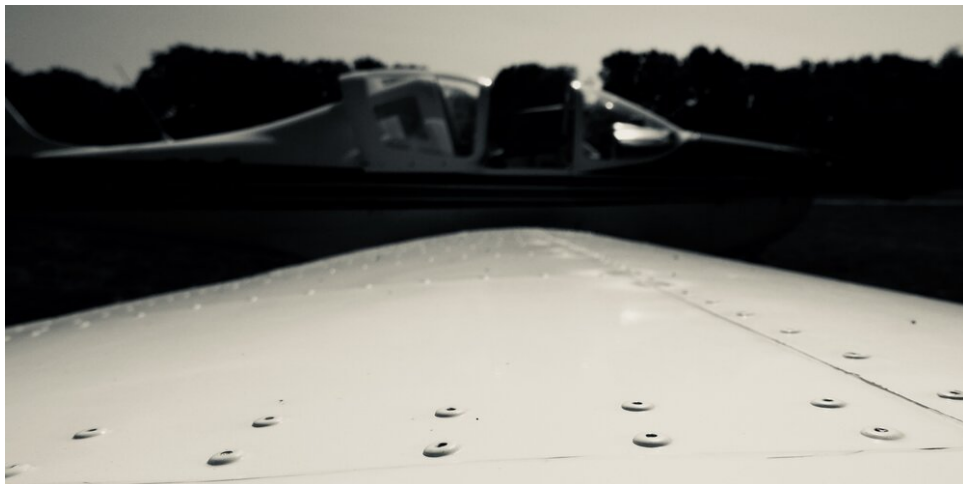
The sky is limit - or is it?

The freedom of flying a plane where you define your own course is fantastic. I am already wondering what the next destination will be!