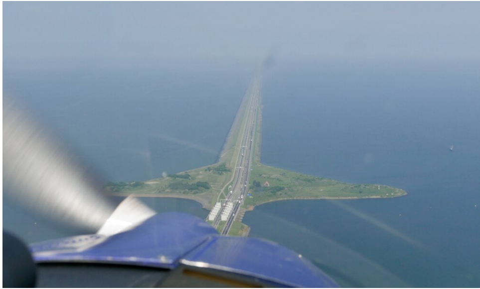
Flying over De Afsluitdijk from Den Oever to Friesland