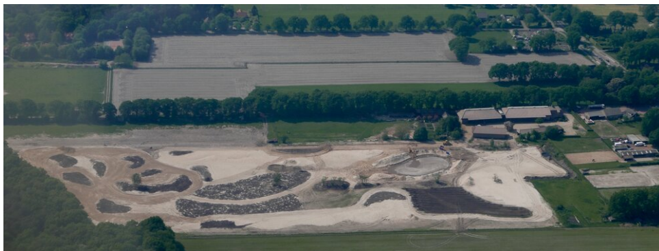
Stichting Dierenzorg Eemland doing major ground works near Soest