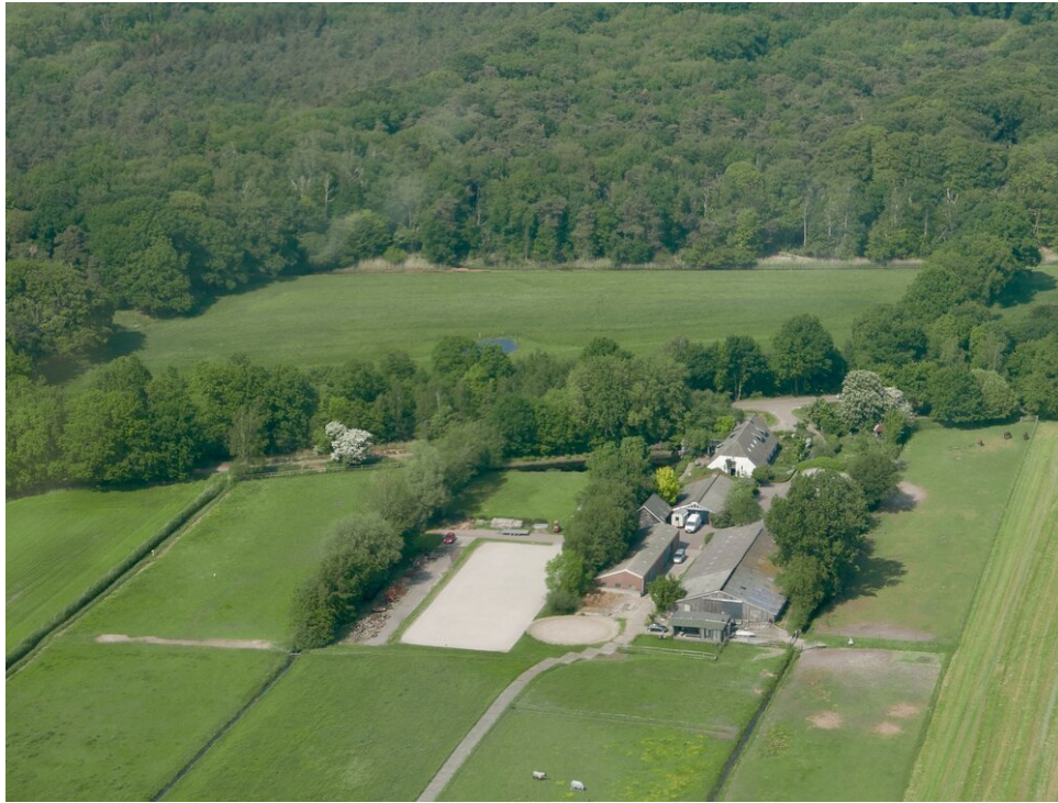
House seen from above near Hollandse Rading