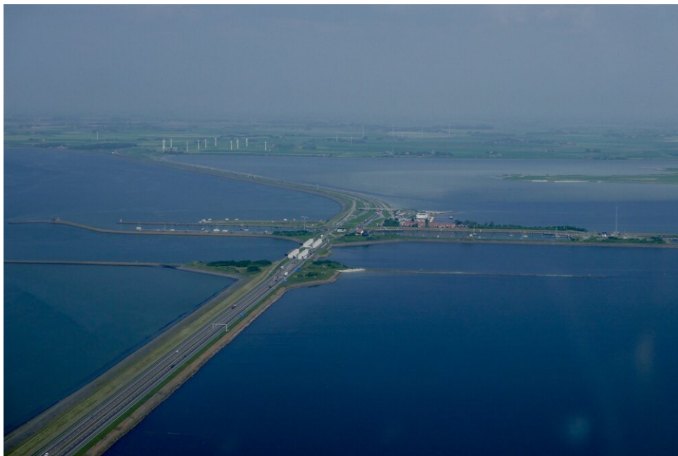
Lorentzsluizen at Kornwernderzand, Friesland