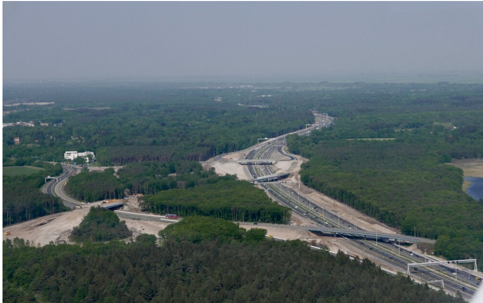
A27 construction works near Hilversum where the unused connection to the never finished A80 is removed