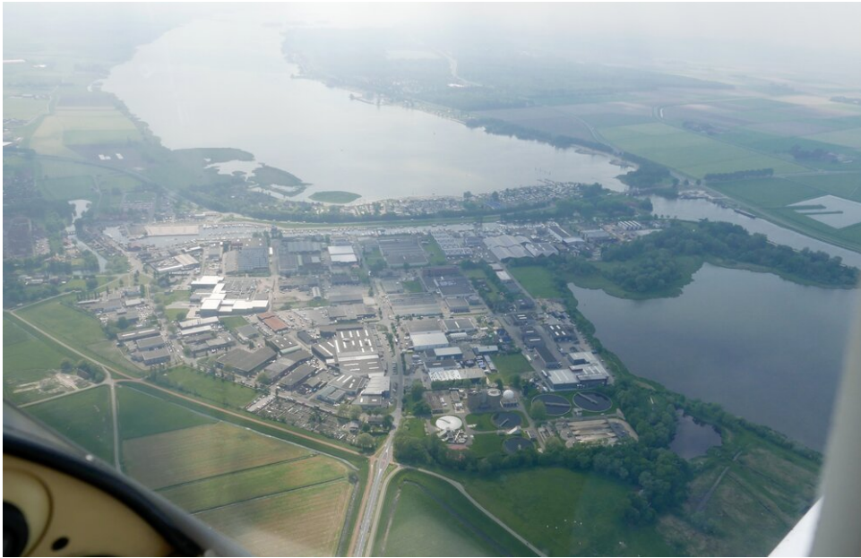
Industrieterrein Elburg, with the Flevomeer (top left) and Drontermeer (bottom right)