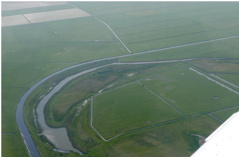
Texel from above, near Plassendaal / Westerkolk

It's really weird to be able to travel so quickly by plane, no customs, no security check, no waiting lines. It's really unlike commercial flights. It's really feels like hopping in, taking off. After lunch we took off again for our return flight.