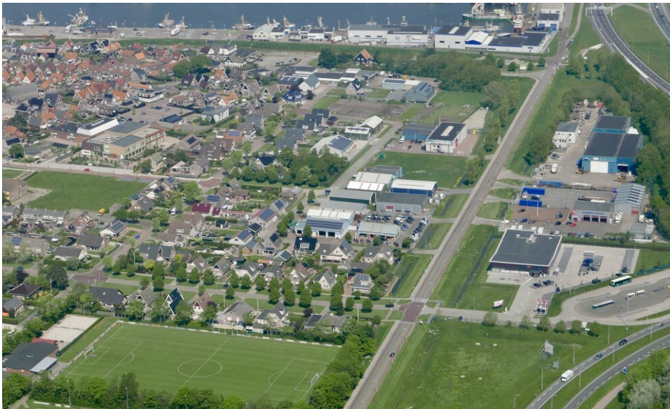
Den Oever with the soccer field from VV Wiron