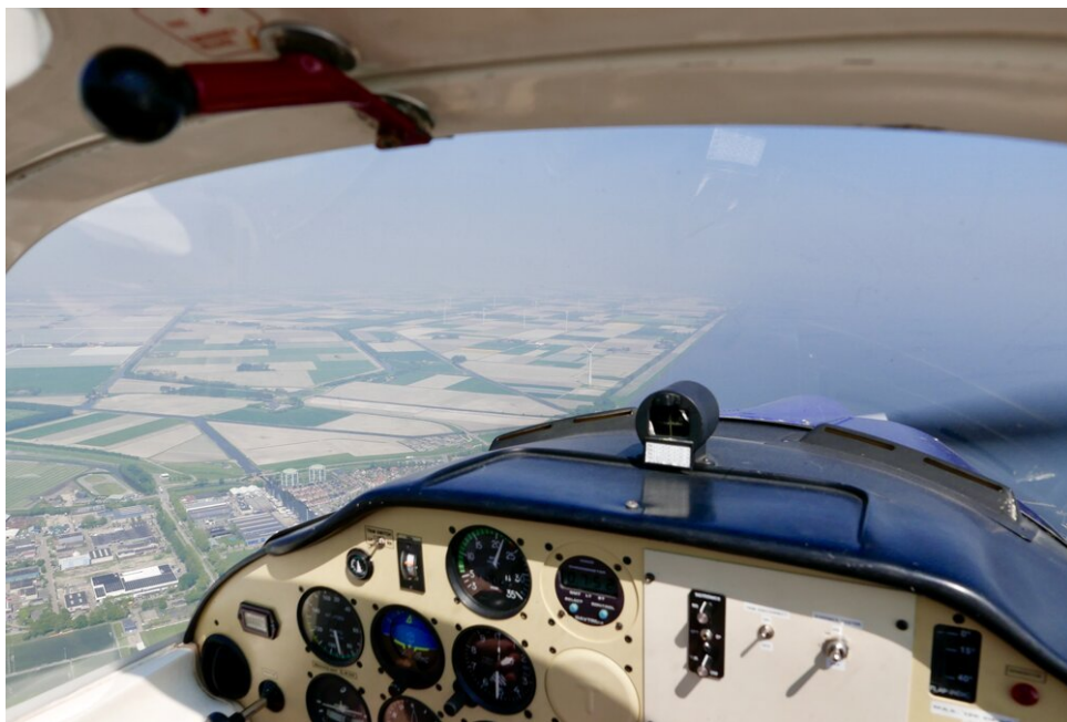
Flying to Texel (the Medemblik Kaapstander towers clearly in sight)

Once landed at Texel (EHTX) we borrowed a Renault Twizzy to get our lunch. Its a weird sensation being on Texel - which is a relaxed island in the Waddenzee - after leaving Hilversum, seemingly just minutes ago.