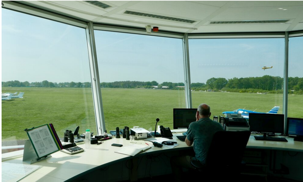
Inside the Hiversum Airport control tower.

Going out for lunch like this is awesome. My flight over The Netherlands also reminded me on how diverse this country is. It's connected and embedded in water like no other country is. It's beautiful and I feel privileged to have seen it from above.