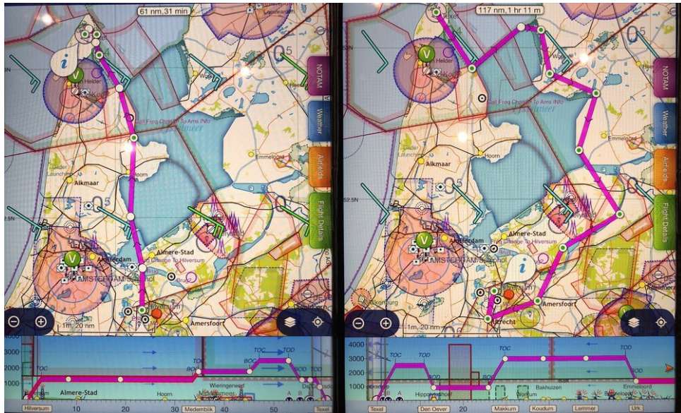
Flight route indicated in purple

During the flight I used my camera to shoot some photos out of the canopy of the plane.