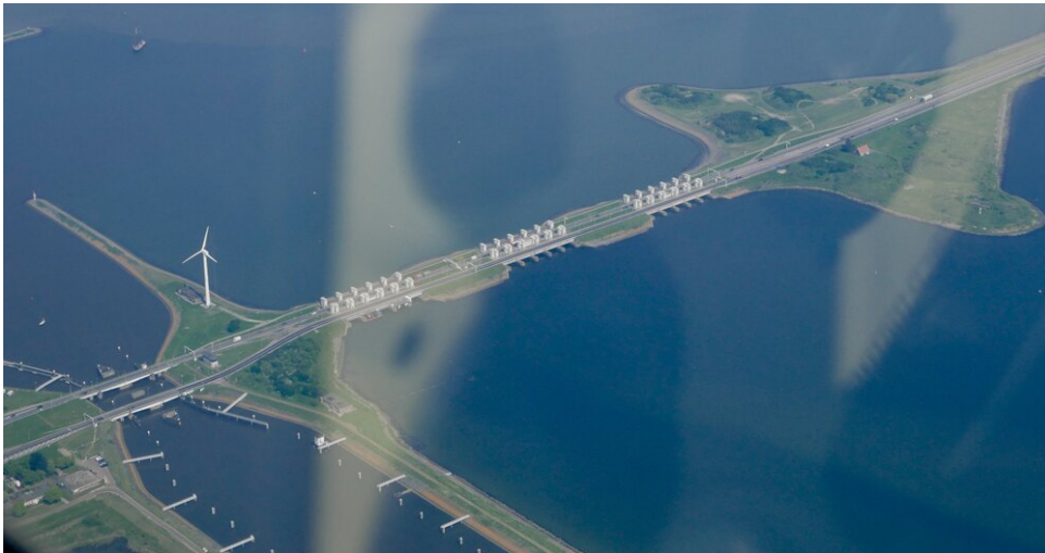
Stevinssluisen near Den Oever, part of de Afsluitdijk