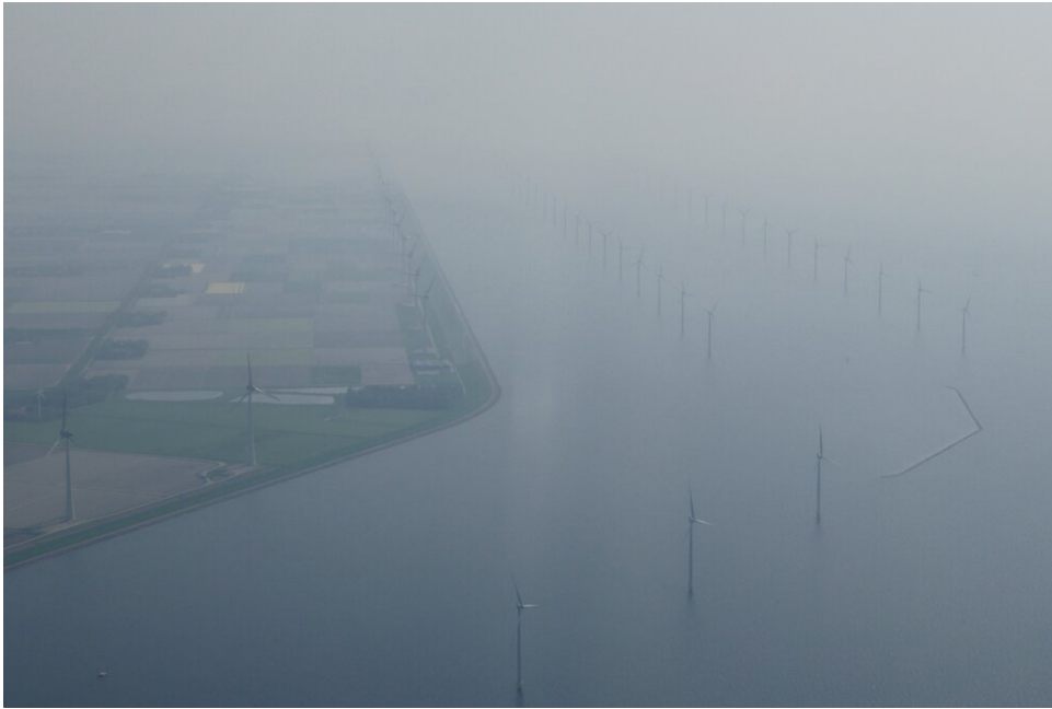
Windpark Noordoostpolder, near Lemmer