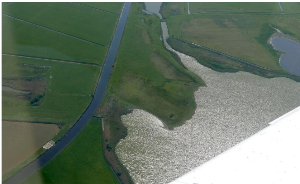
Westerkolk reflecting the sun light at Texel