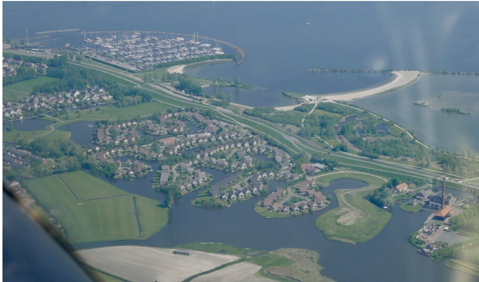
Medemblik (with the regattacenter in the top left)