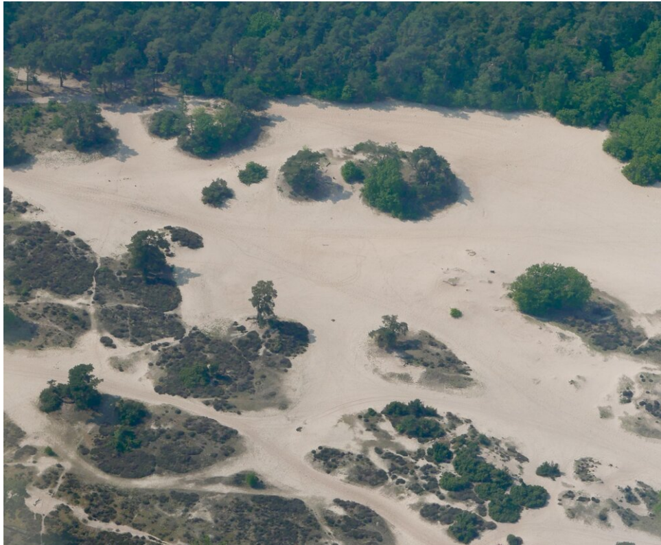
De Korte Duinen, Soest, seen from above