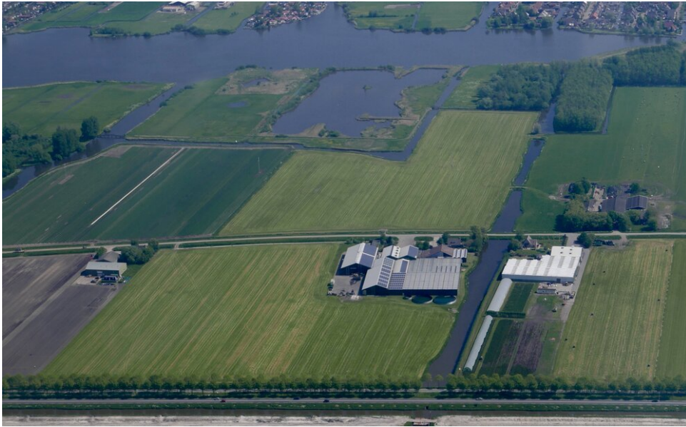
From above you can clearly spot buildings with solar panels, Smak Tulips near the N240, south of Medemblik