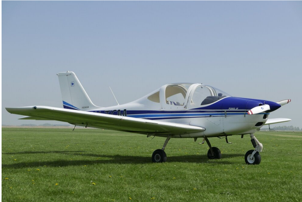
Tecnam P2002JF - PH-TCM

It's a small plane with two seats, one for the pilot and one for a passenger. It's build from aluminium and it's powered by a single engine that's directly connected to a propellor.