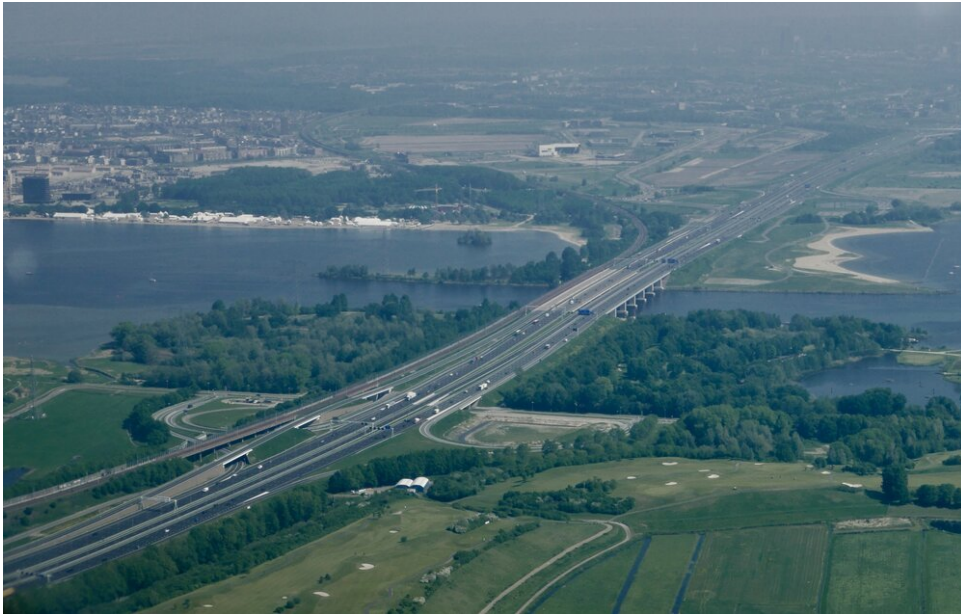
The Hollandse Brug (A6 near Almere)