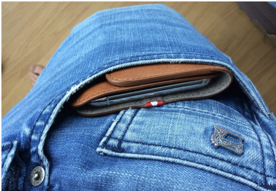
The wallet allows quick (and naked) access to the phone

For my smartphone I selected the " Hardgraft iPhone cash card wallet ". It is an iPhone sleeve combined with a thin wallet, designed for a few cards and some cash.