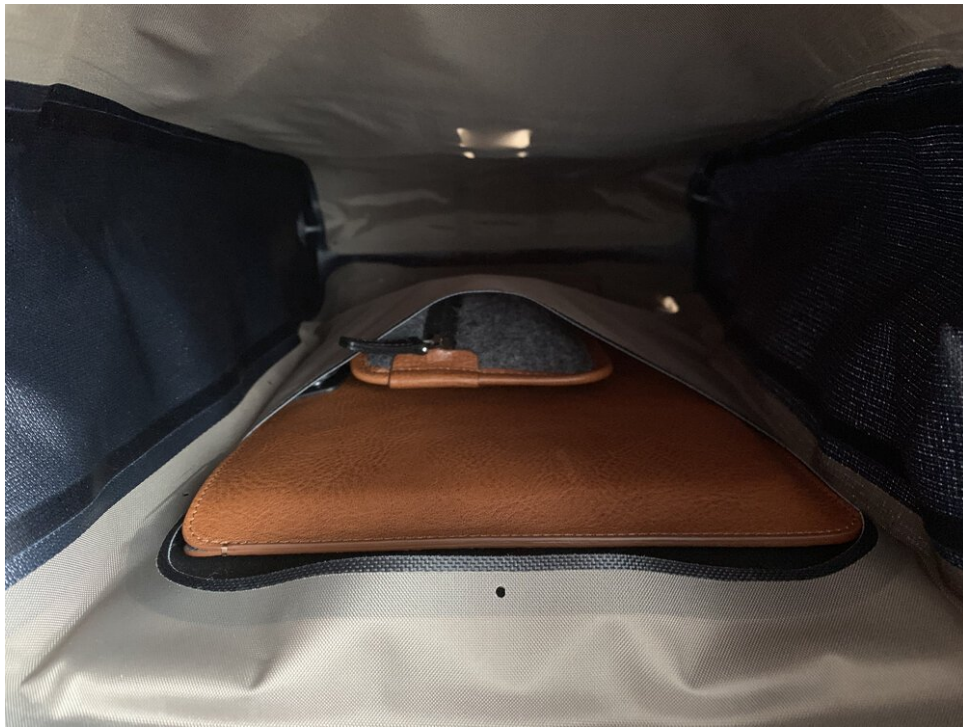
Inside the Ortlieb Urban Daypack - comfortably spacious

The inside of the backpack is spacious and features a sleeve that allows the devices to stay in position (while you move around with the backpack). There is enough space left for lunch, a spare set of clothing or something else.