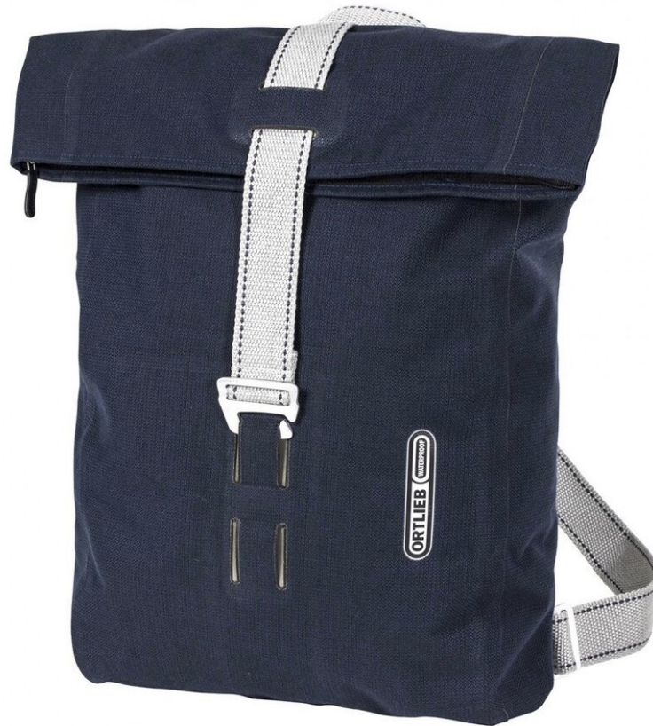
Ortlieb Urban daypack 15L

The new Urban line from Ortlieb is designed to appear a little less hardcore, and a little more "urban chic". Its made of a special blend of cotton and Cordura fabrics, the bag has a textile appearance that is a perfect match for both casual and business attire. Thanks to a supple plastic inner coating (polyurethane), it is nonetheless absolutely waterproof.