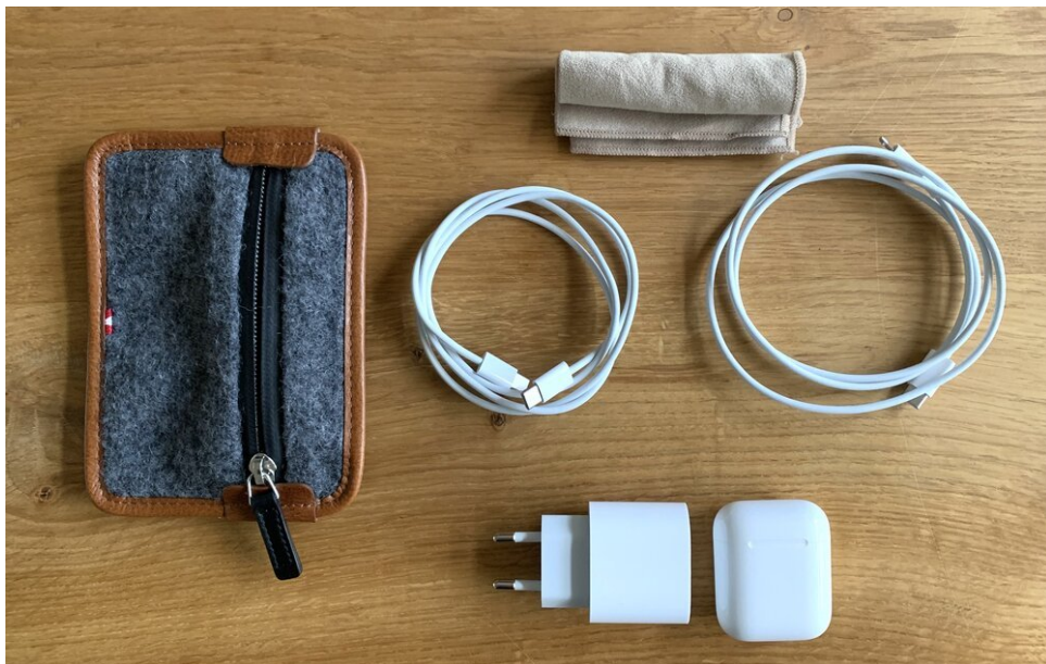
Peripheral case "thing"

To complete my set, I found a suitable "thing" that would fit the charger, cables and AirPods. Combining the peripherals into a single package seemed to be the perfect way to organise my 'business in a bag' package.