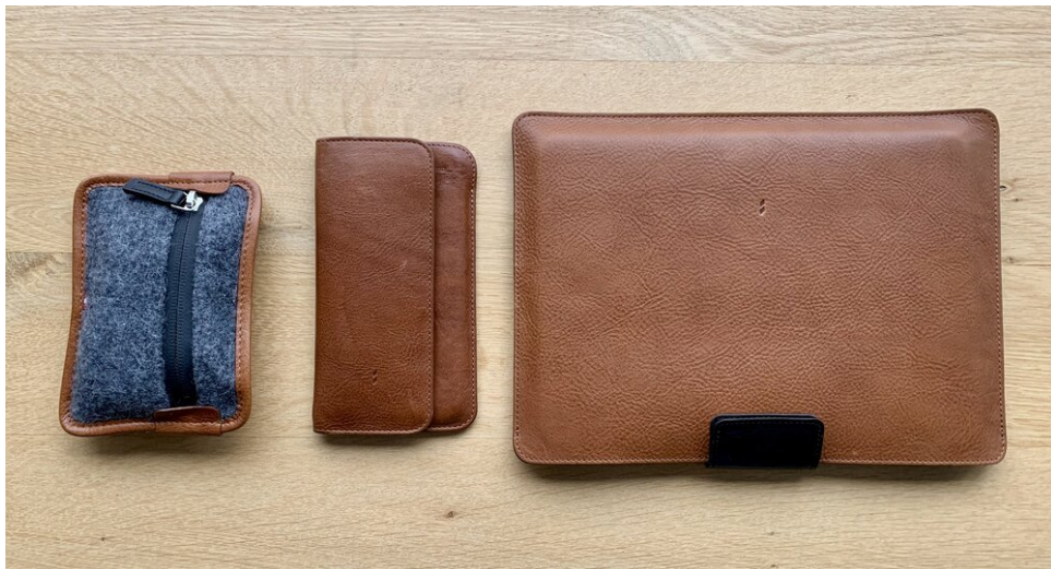
Awesome threesome... of sorts

Organising my gear in three smaller packages allows quick and independent access. Each item is high quality, yet mundane enough to stay under the flashiness radar.