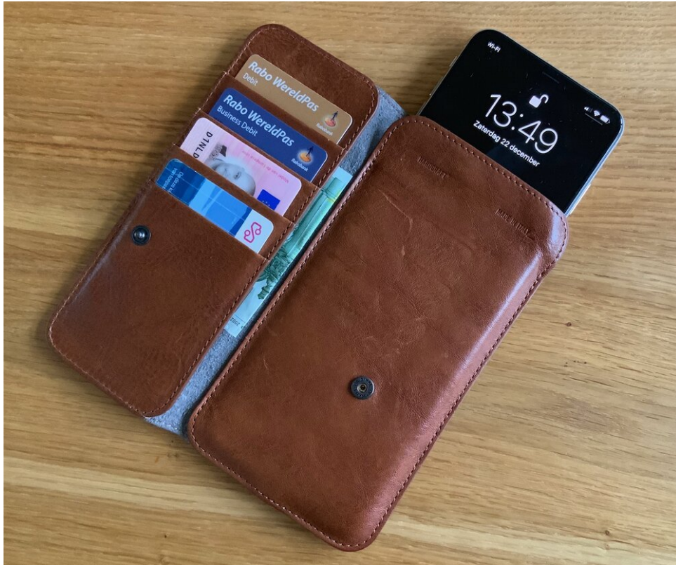
Hardgraft iPhone cash card wallet

For my smartphone I selected the " Hardgraft iPhone cash card wallet ". It is an iPhone sleeve combined with a thin wallet, designed for a few cards and some cash.