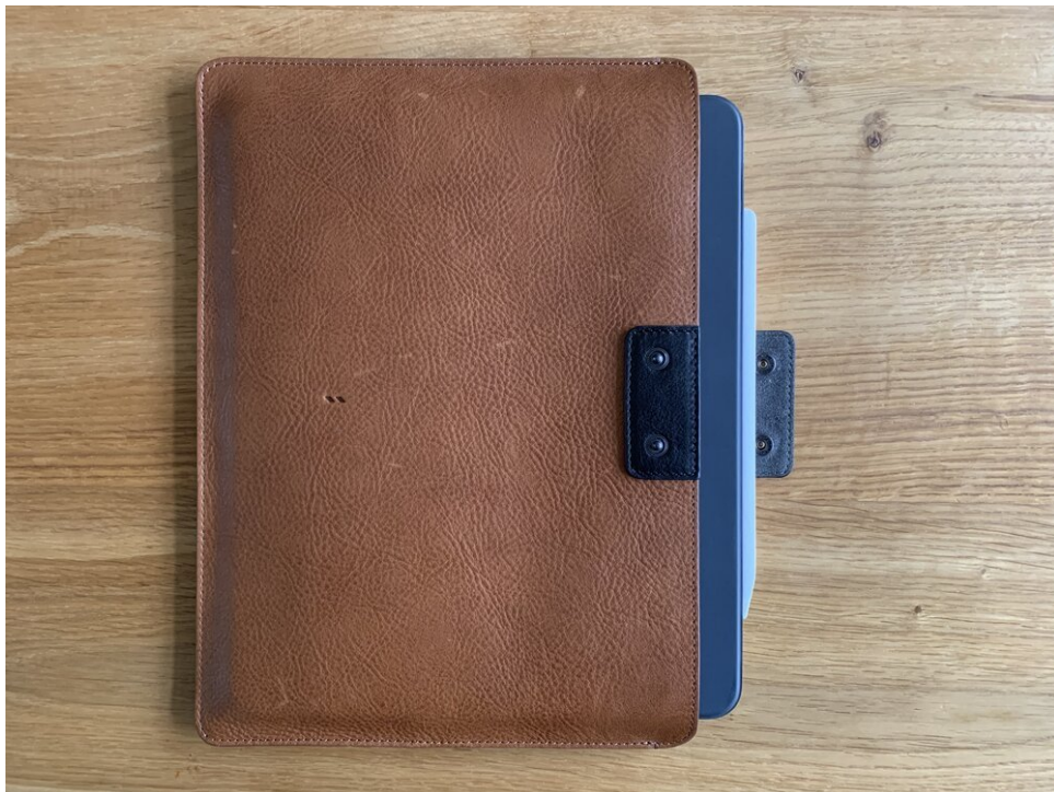
Hardgraft iPad Pro case with the keyboard folio and Apple Pencil

Matching the iPhone's wallet, I have selected a case for iPad that allows quick and complete access when I use the device. When I transport the iPad it is nicely (and stylishly) protected.