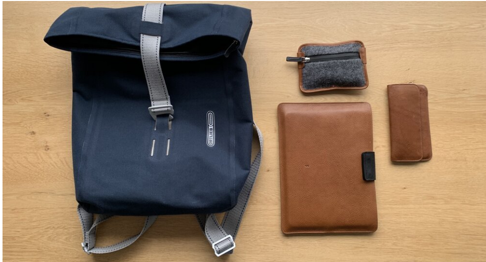
Packing it together, Hardgraft and Ortlieb

The inside of the backpack is spacious and features a sleeve that allows the devices to stay in position (while you move around with the backpack). There is enough space left for lunch, a spare set of clothing or something else.