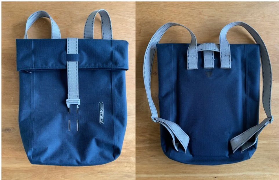
Adjustable straps without loose ends.

For my gear I have chosen the smaller 15L version (there is a bigger 20L available). The bag has a nice strap system that is adjustable without any loose ends (the straps end in a loop).