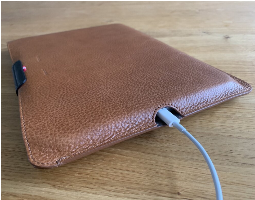
The iPad can be charged while tucked away in its case

The great thing about this Hardgraft iPad Pro case is that it fits the entire iPad with the keyboard folio and pencil attached. Just like the iPhone wallet, there is a clever hole in the sleeve that allows charging.