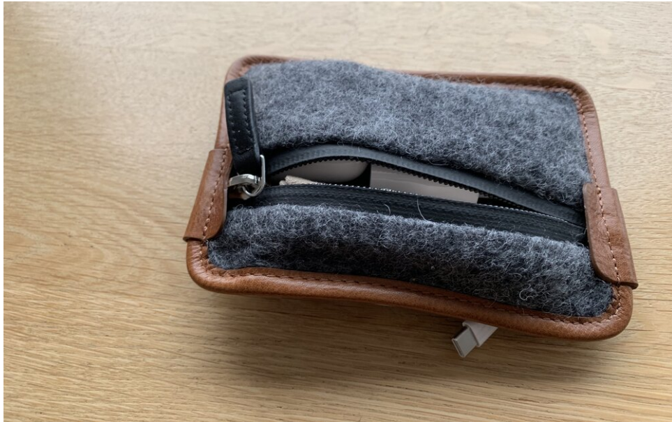
Access to accessoires from both sides of the "thing"