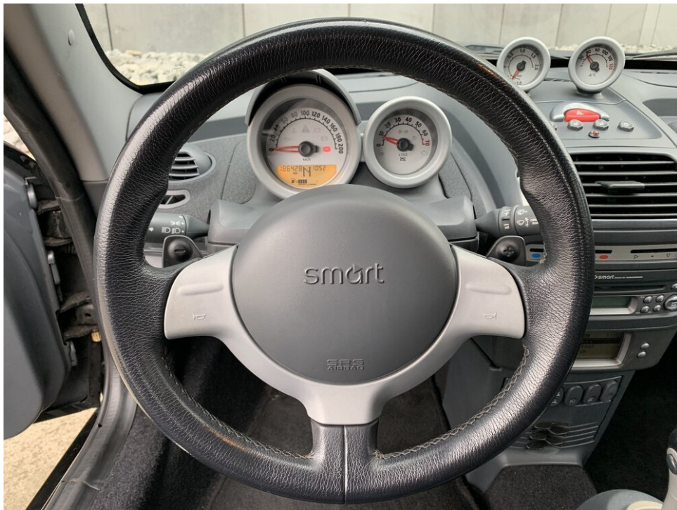
Smart Roadster steer - notice the F1-style gear flaps

Although it's a tiny sports car, the interior is quite alright, even if you're a bit longer (like me \pm 1,93\text{M} ). On the dashboard there are extra gauges that add to the sports car vibe.