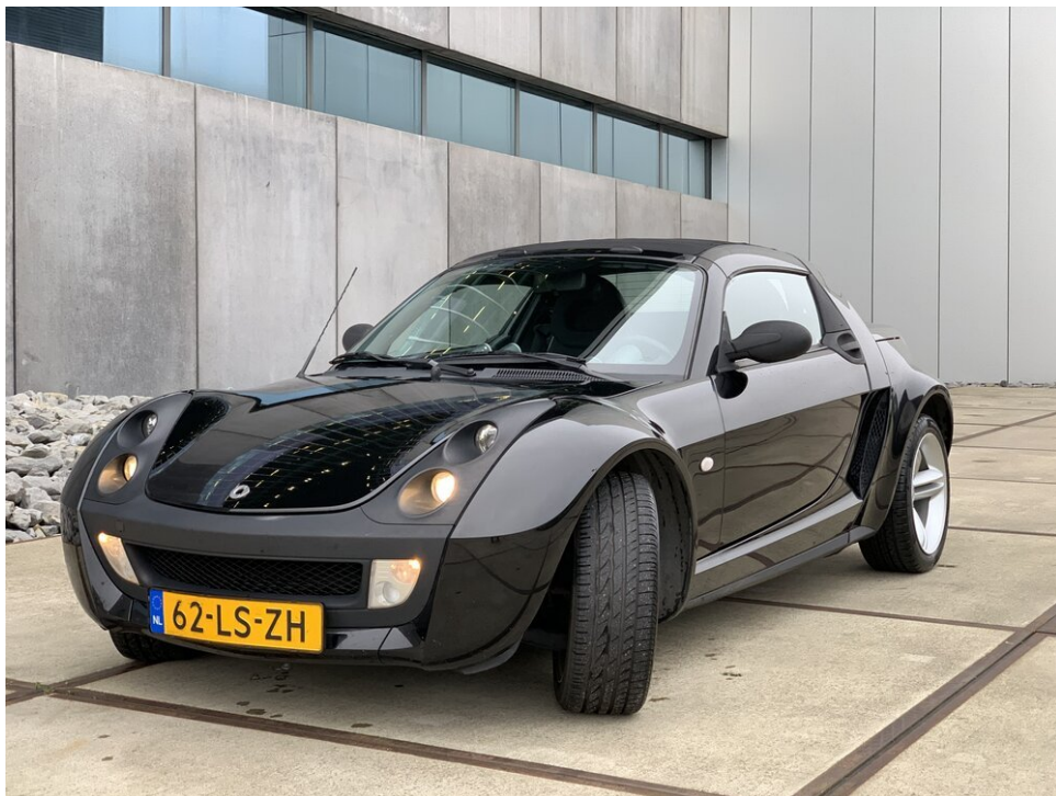
Smart Roadster - all black