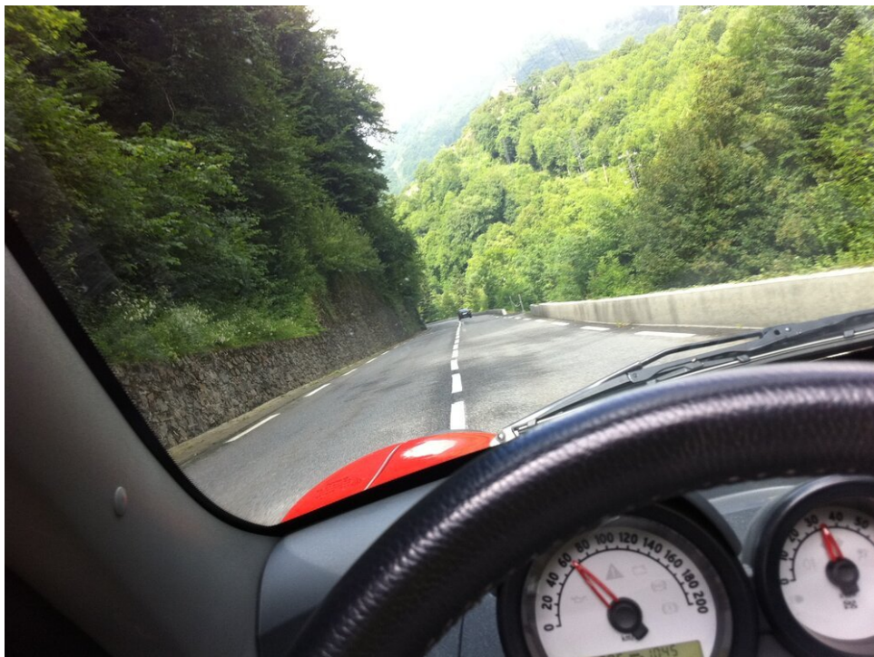
Twisty mountain roads - pure fun in a Roadster! (near the French/Spanish border)

If you find a twisty road somewhere (in southern) Europe, you'll enjoy the Smart Roadster at its best. Think of a street legal roller coaster that will keep you smiling for hours!