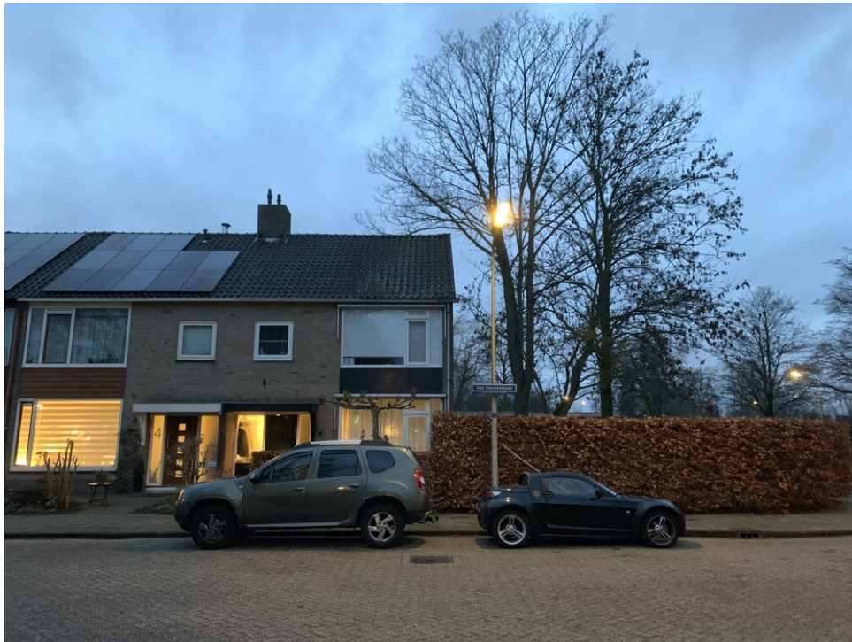
The arrival of the family car...

Europe, the busy streets in The Netherlands are much less fun to drive these days. Traffic, speed bumps, speed limits and distracted drivers demand your constant attention, taking the fun away.