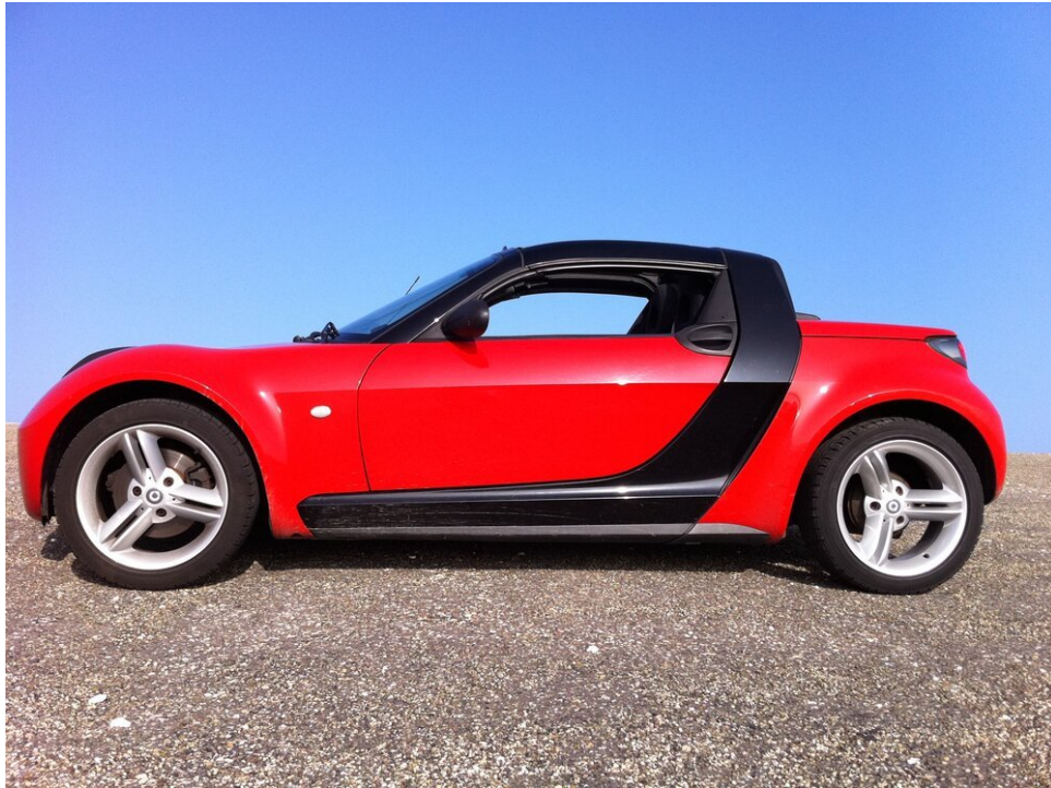
Smart Roadster - spice red

The Smart Roadster is powered by the Mercedes-Benz turbocharged 3-cylinder Suprex engine (60kW, 80HP), located in the rear of the car. It's a tiny engine, but so is the car, weighing around 800KG. Combined with the rear wheel drive, grippy tires and a F1 flappy pedal gearbox, this is an ideal mix for driving fun!