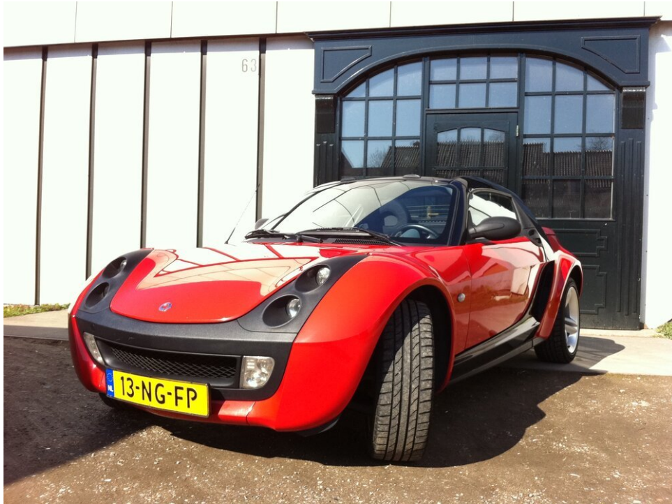
Grippy tires provide plenty of contact with the tarmac