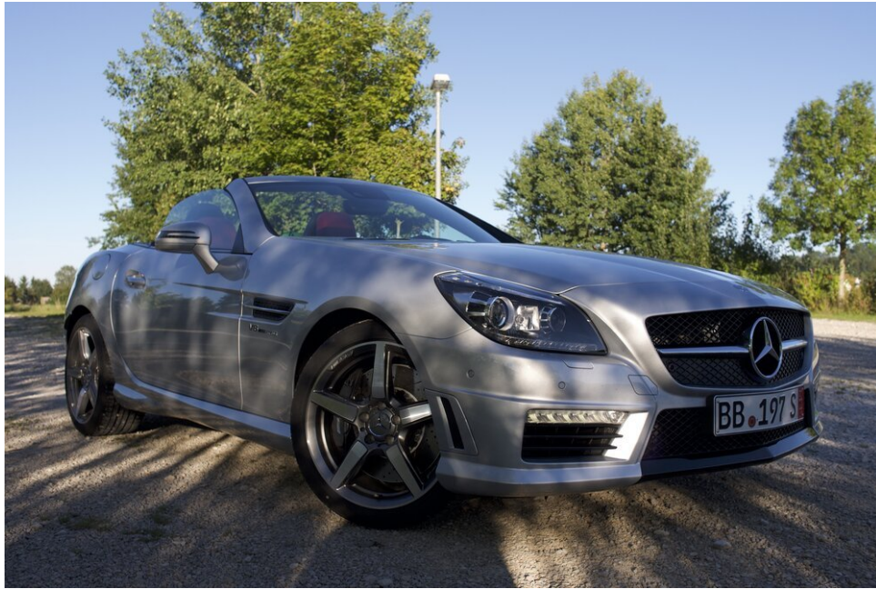
Mercedes-Benz SLK55 AMG V8 5.5L

Chances are that you come up with different answers for these different cars. That's the point: the car communicates. Even if you don't care about your car's performance as status symbol, other people will. It's therefore something to consider when you buy one.