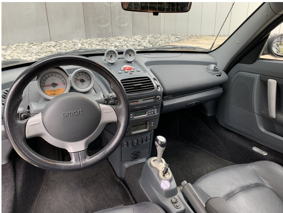
The car's interior is quite spacious - even if you're tall