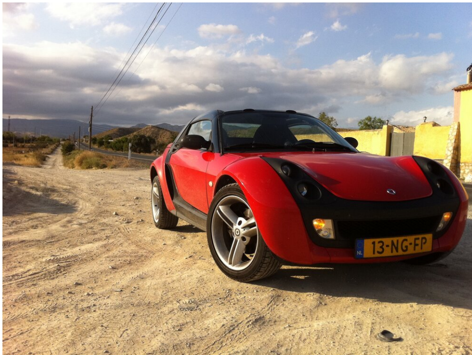
Make sure to skip the highway, take the country roads (in Spain, near Alicante)