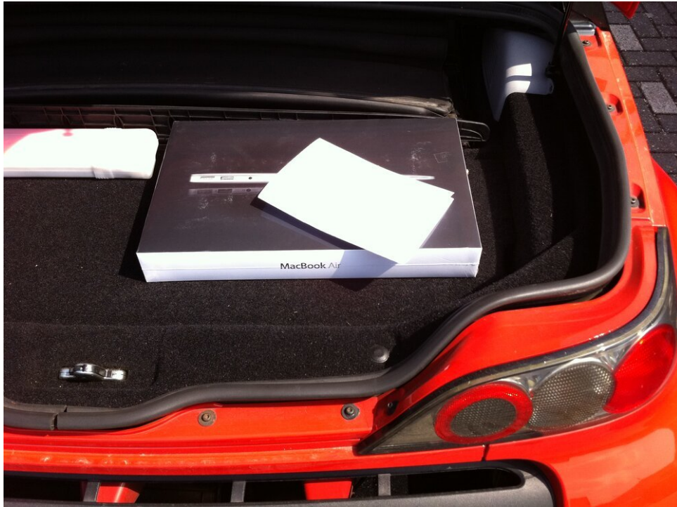
The spacious trunk is big enough for a laptop or two