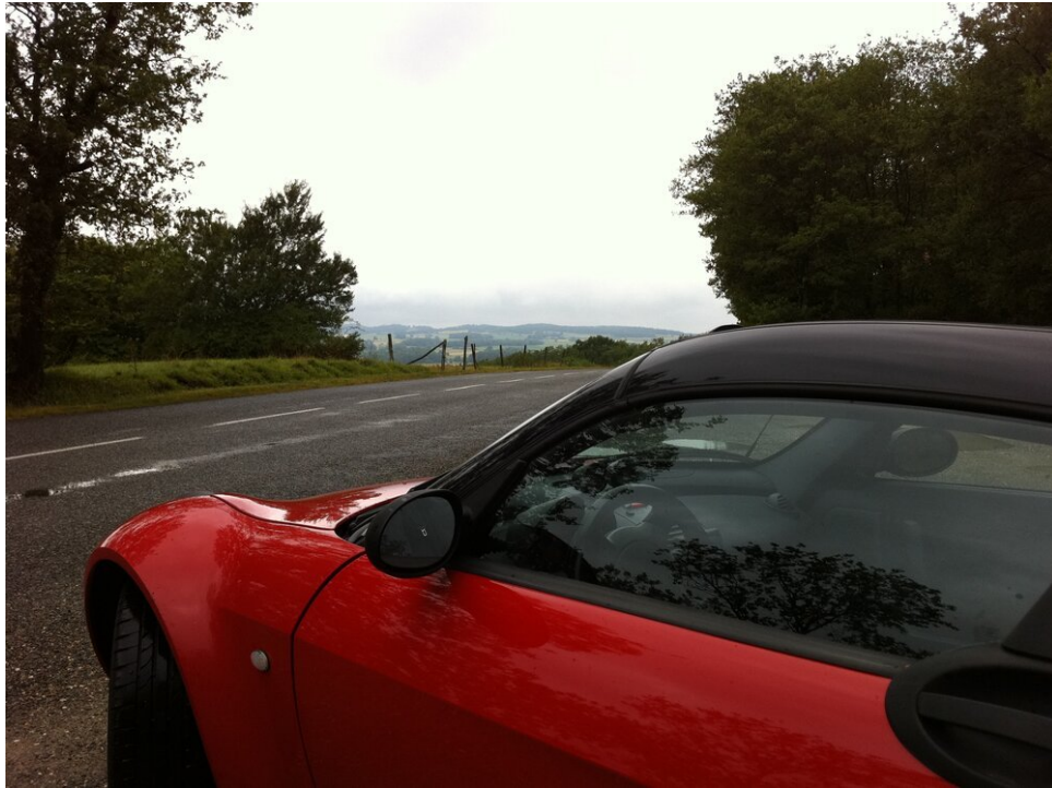
Enjoying a little 'up and down' in the hilly countryside