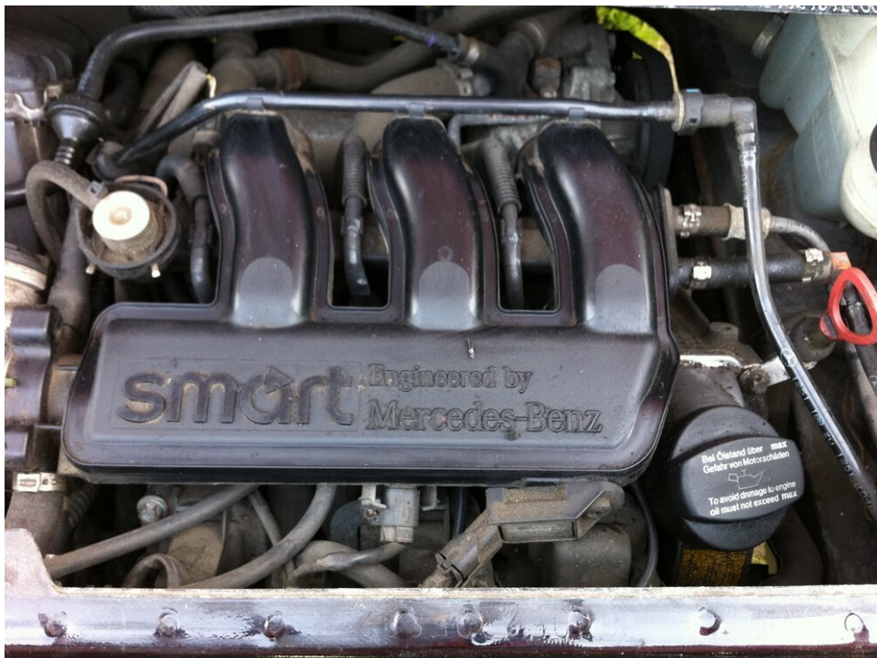
Mercedes-Benz 3-cylinder Suprex engine

The Smart Roadster is powered by the Mercedes-Benz turbocharged 3-cylinder Suprex engine (60kW, 80HP), located in the rear of the car. It's a tiny engine, but so is the car, weighing around 800KG. Combined with the rear wheel drive, grippy tires and a F1 flappy pedal gearbox, this is an ideal mix for driving fun!