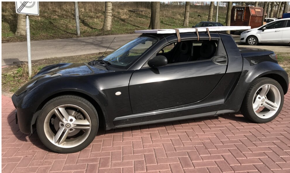
With three straps and some cardboard, you can easily transport paintings of all sizes