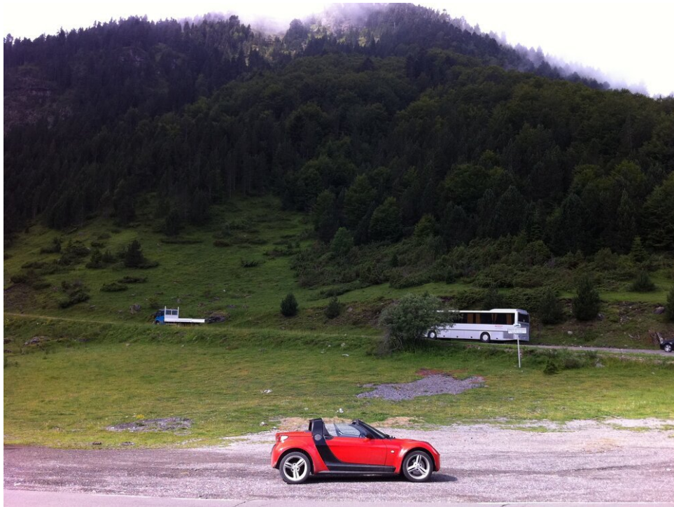
Driving my Smart Roadster in the Pyrenees mountains (France)

If you find a twisty road somewhere (in southern) Europe, you'll enjoy the Smart Roadster at its best. Think of a street legal roller coaster that will keep you smiling for hours!