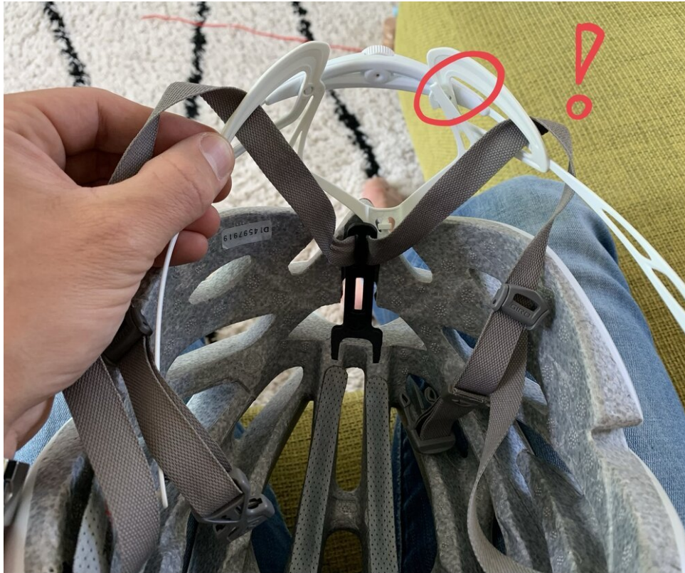
The Roc Loc 5 broken in my Giro Aeon helmet