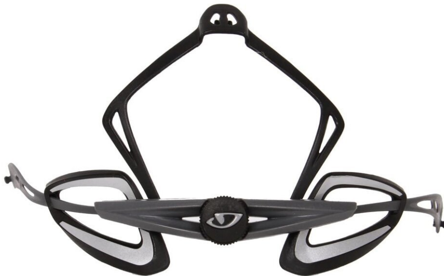
Roc Loc 5 - try finding this part on the internet...

The only other thing I could think of was replacing the faulty Roc Loc 5 system. When the helmet was new this would have been easy peasy. Just order a new part "et voila". But Giro does not produce the Aeon anymore, and conveniently enough newer models do not use the Roc Loc 5 system... this smells like planned obsolescence to me, bleh!