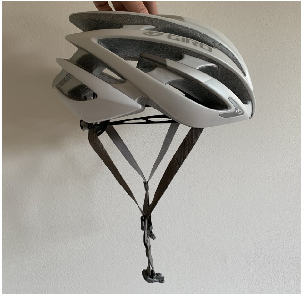
Side image the helmet

While my new Roc Loc 5 was shipping, I did find another store selling new old stock paddings for my Aeon helmet. A fresh set of paddings would make my helmet feel (and smell) new again!