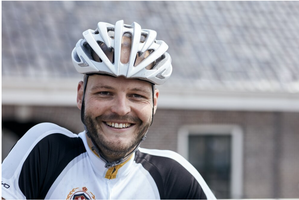
Wearing the Giro Aeon helmet