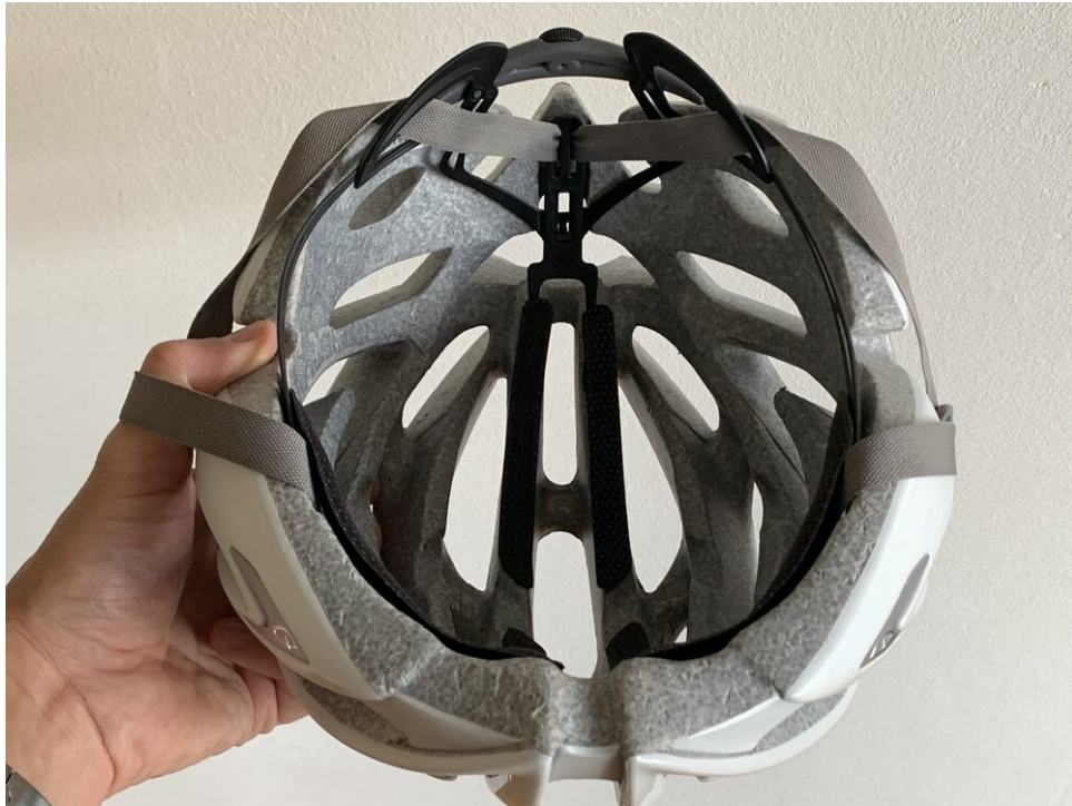
New Roc Loc 5 installed