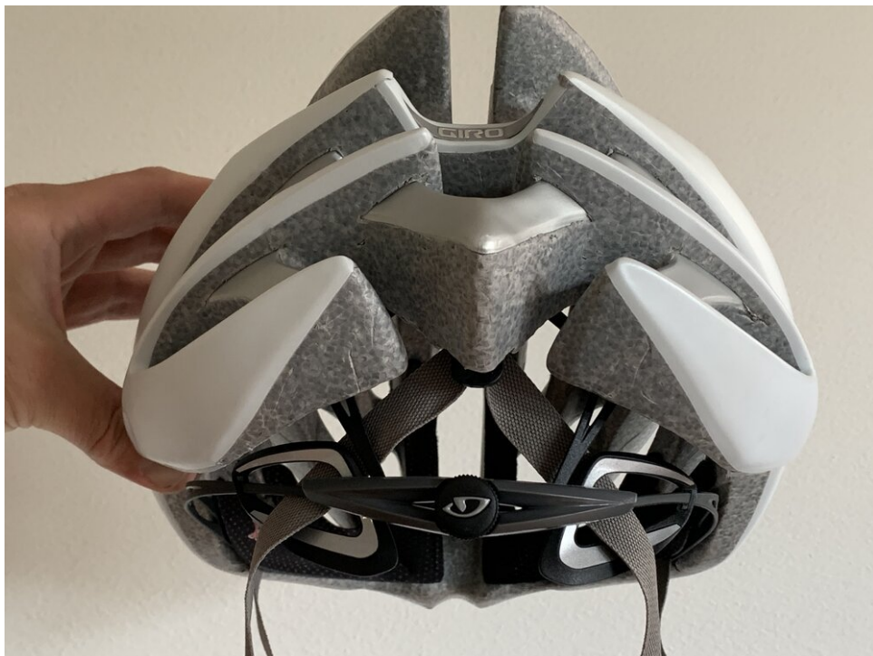
Rear of the helmet, note how the strap goes through the Roc Loc 5