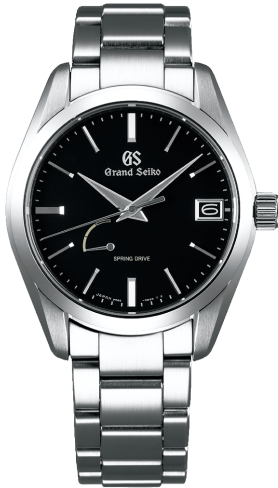
Grand Seiko SBGA285 Spring Drive

The local Seiko boutique in Amsterdam offers you access to the fine Japanese craftsmanship of Grand Seiko. Amidst mediocre mainstream shops, you'll be forgiven if you miss it. The boutique's shelves provide you with a glance into - what almost seems - an alternative reality with meticulous attention to detail. Photos hardly do the fine artwork justice, the watches must be seen in the metal to appreciate their quality.