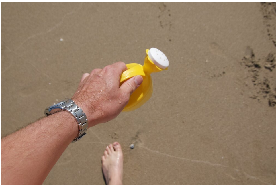
Sandy beaches and plastic watering cans pose no problem for the stainless steel case

The watch has no trouble facing the daily challenges of my life as a father, a programmer and as the man around the house doing some mandatory gardening... Water does not scare the stainless steel case of the watch, neither does dust or yellow creatures from the kid’s corner. This wrist worn companion happily joins you on your adventures.