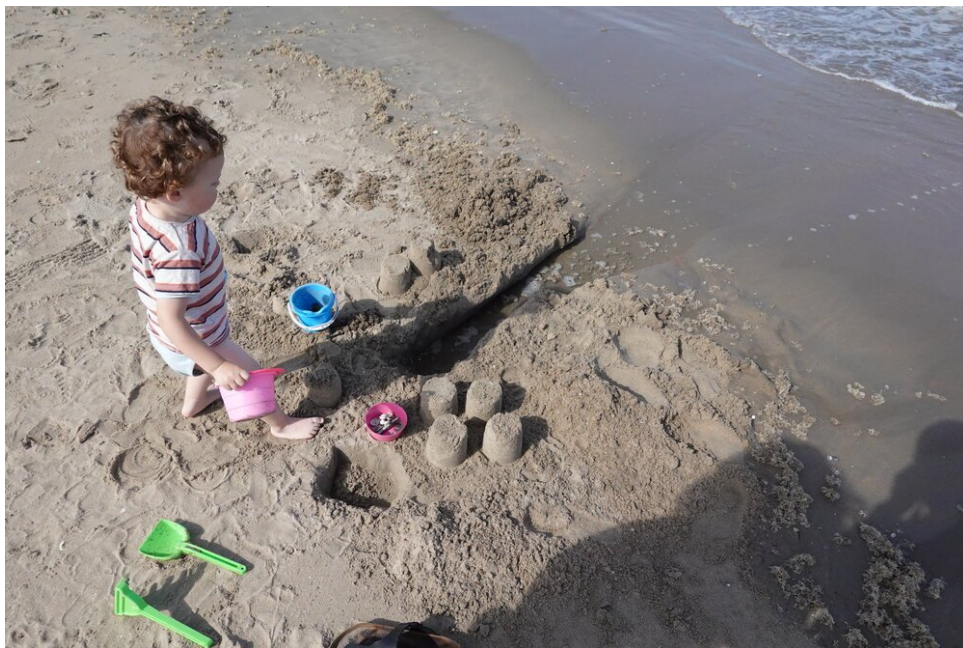
Combining water and sand offers a fascinating way to learn about the powers of the sea