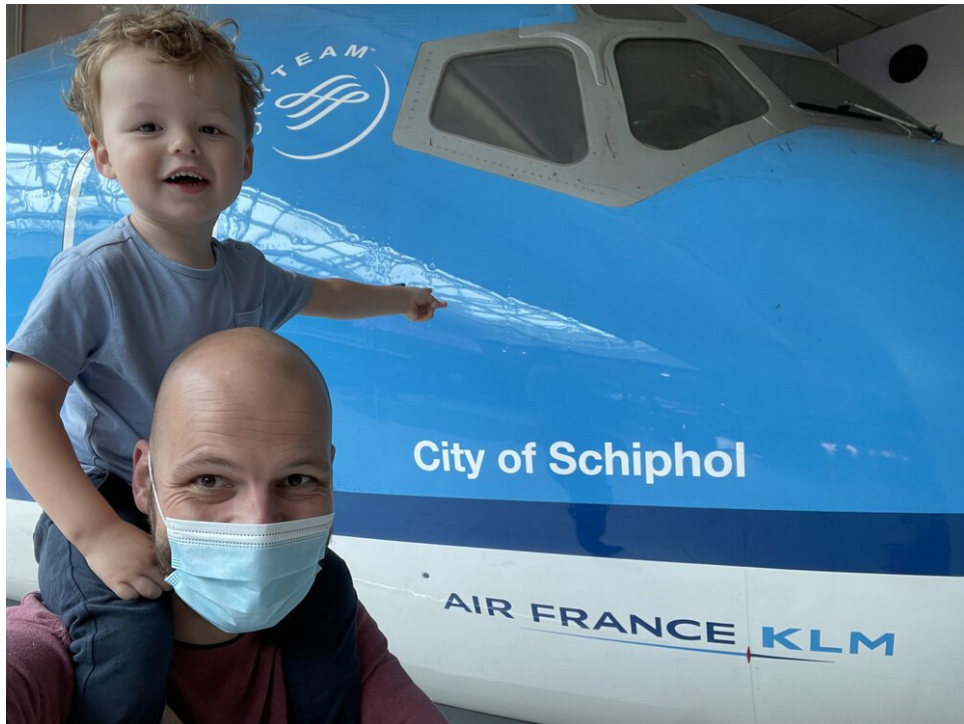
This plane flies everywhere - yet it never leaves the ground (at Schiphol Airport Amsterdam)