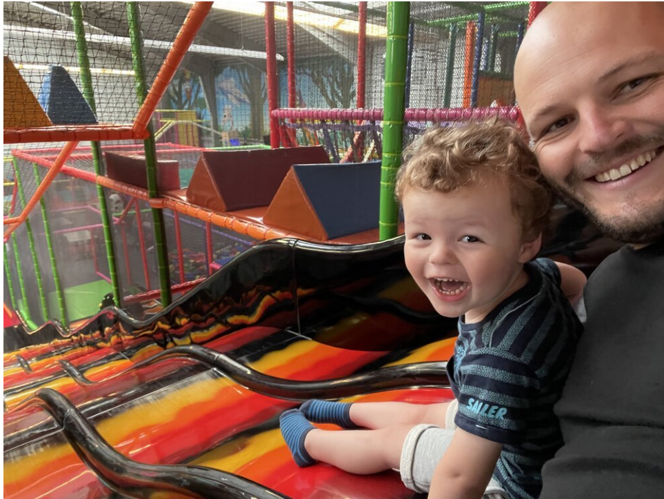
Going down together!