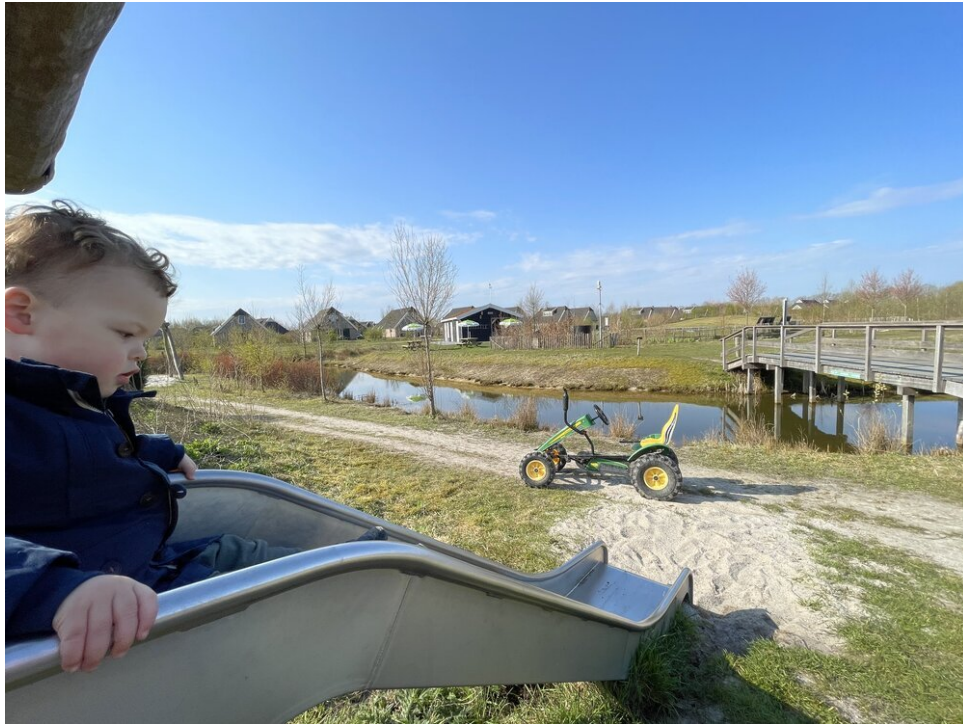
Go down the slope after climbing a "mountain"!