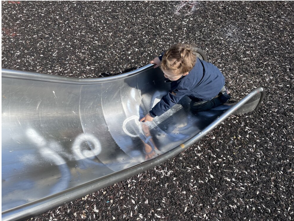
Mysterious markings on the slope - what do they mean?