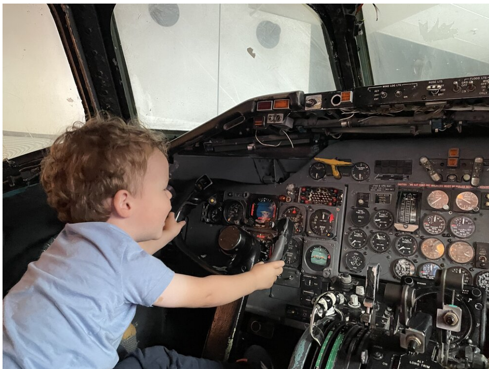
Young pilots at the helm take you to places one can only dream of!

One of most influential professors at the University during my Master education always challenged the students in the room: "BUT-, IS IT FUN?!" With all his wisdom he saw the need to remind young and bright minds on fun. When was the last time you