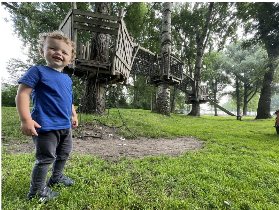
Only brave men take the tree top tour... "Will daddy follow along?" YES, you bet!