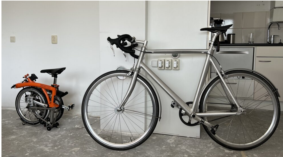
My Brompton foldable bike compared to my Schindelhauer Siegfried Road: two very different machines

As I like cycling , my trained legs allowed me to easily go much faster than I thought was comfortably possible on a foldable bike. The Brompton quickly gives you the confidence to handle it like a normal bike. While great handling may be considered table stakes for any bike, I am sorry to notice that many modern "designer bikes" seem to have missed that memo. Any bike should be a pleasure to ride - before anything else!