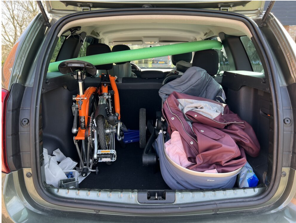
The Brompton in our family car: taking up less space than a baby stroller!

If you live in an urban area you might enjoy the fact that it is very easy to bring the bike with you inside. No need for bulky locks or to unnecessarily expose it to the elements or thieves. Chances are that you can always find a place for your bike, even inside your favourite coffee bar .