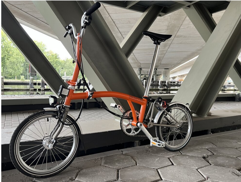
My modern Brompton foldable bike - note how similar it is to the earlier model