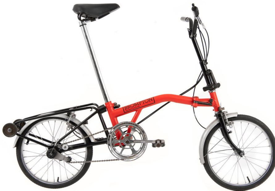
Early Brompton model