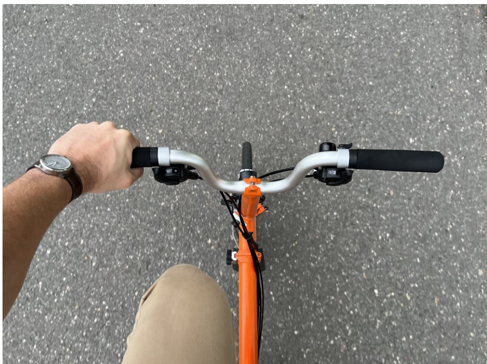
Riding the Brompton foldable bike surprisingly doesn't feel much different from a normal bike: it quickly gives you the confidence needed to go faster (if you wish)

As I like cycling , my trained legs allowed me to easily go much faster than I thought was comfortably possible on a foldable bike. The Brompton quickly gives you the confidence to handle it like a normal bike. While great handling may be considered table stakes for any bike, I am sorry to notice that many modern "designer bikes" seem to have missed that memo. Any bike should be a pleasure to ride - before anything else!