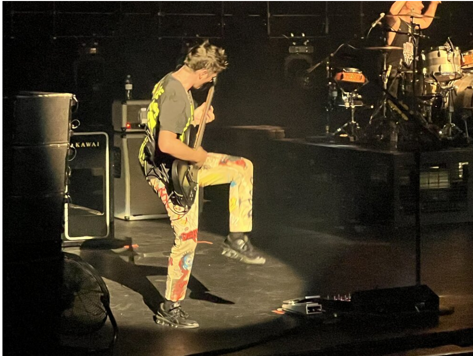
Matthew Bellamy playing the guitar - you know you're in a small theatre when you can read the text on his shirt / pants