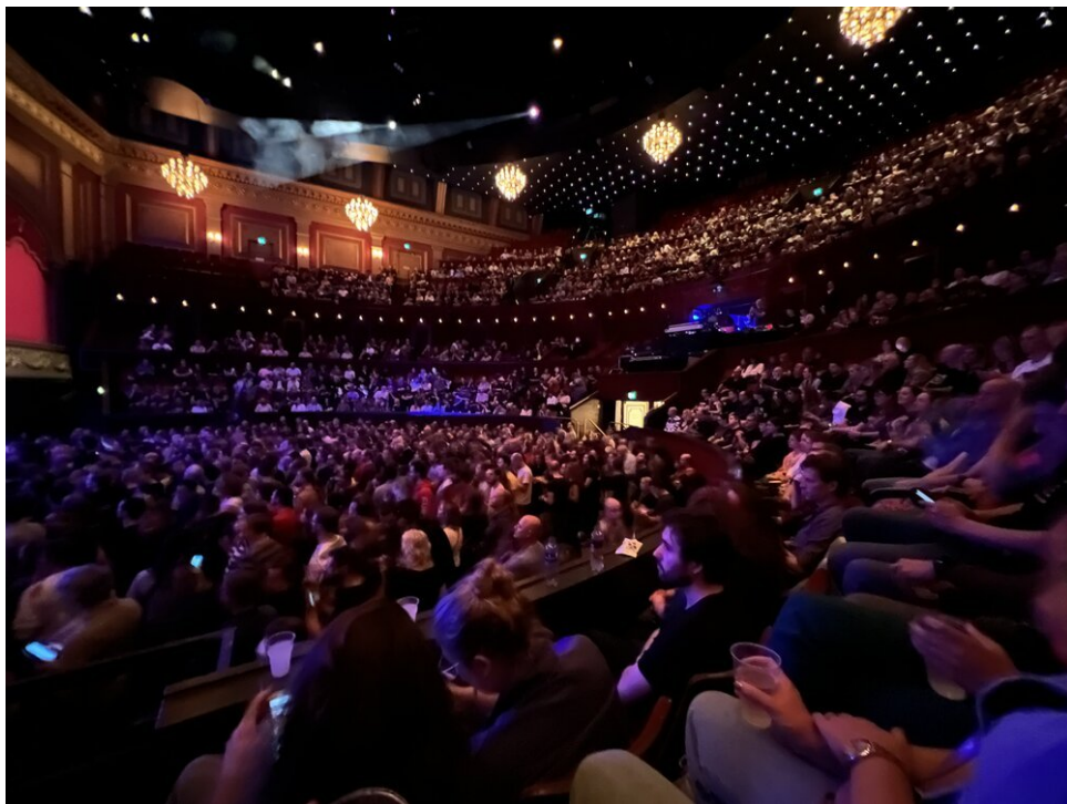
Full house: the theatre has a capacity of just a few thousand