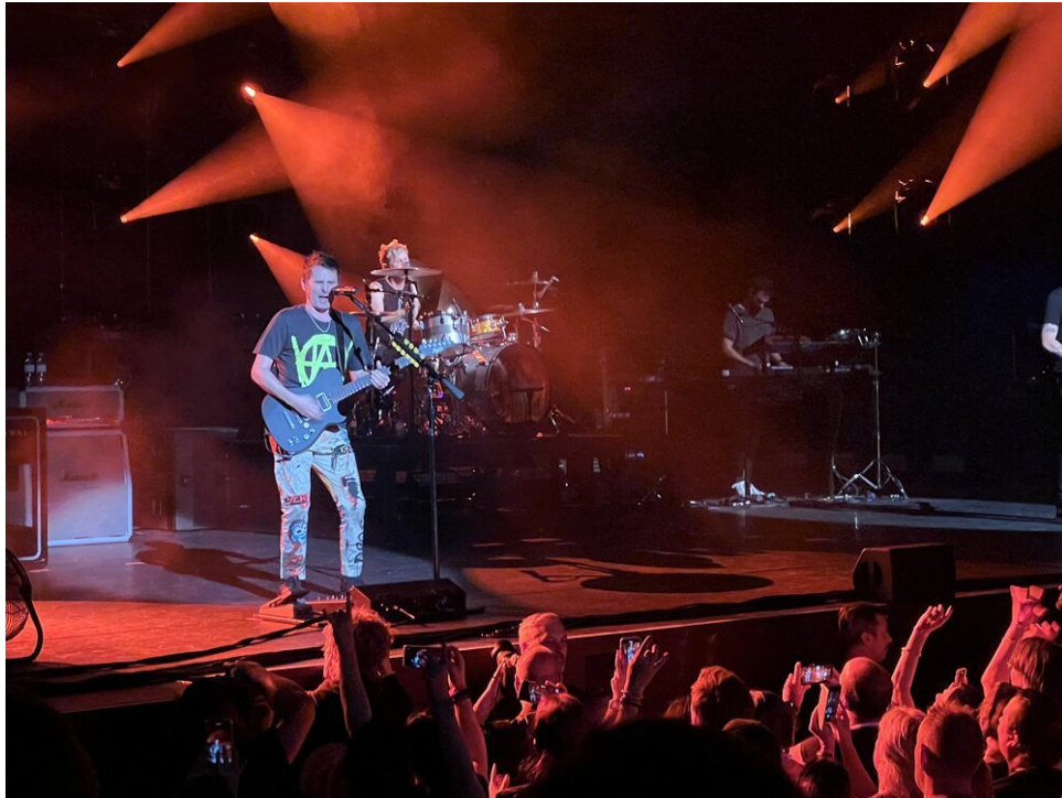
Lead vocalist Matthew Bellamy singing