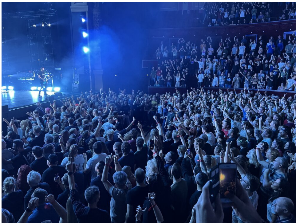
A mosh pit in Theatre Carré!!