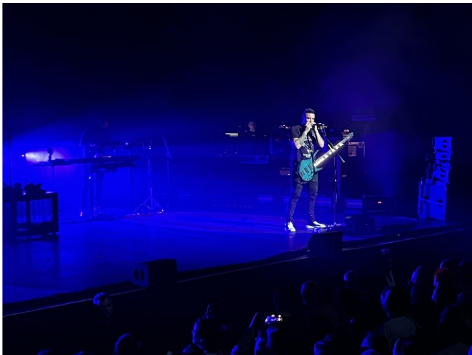
Chris Wolstenholme playing the harmonica for the "Knights of Cydonia" finale