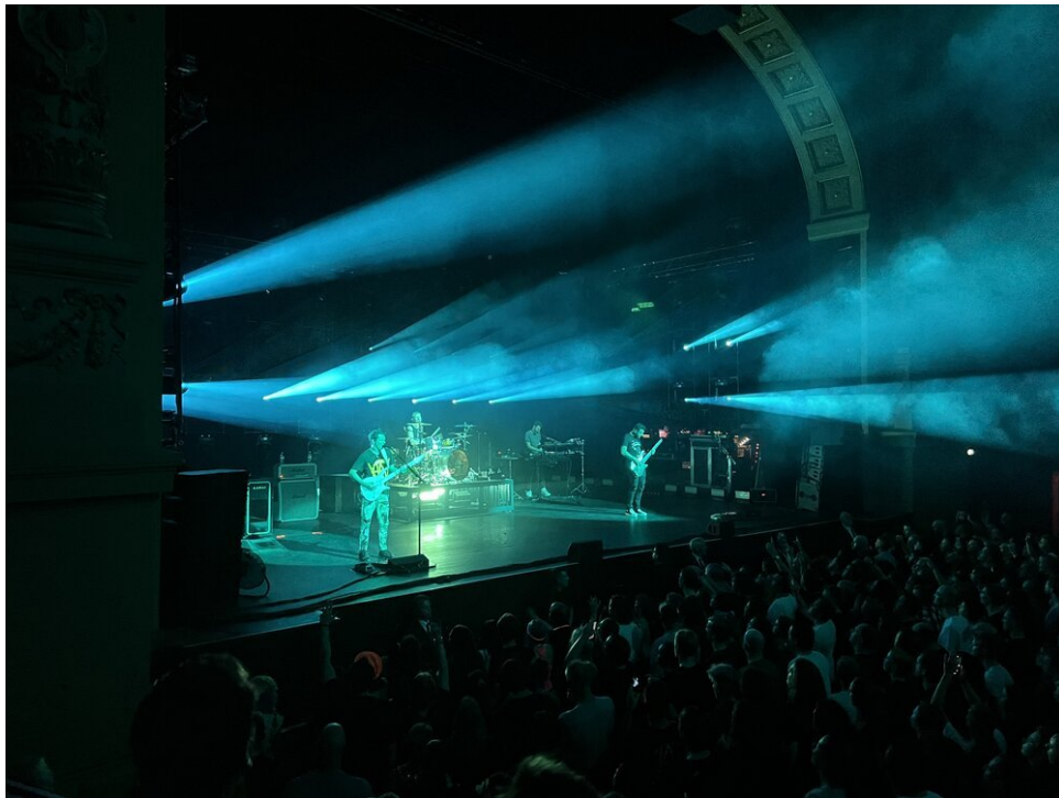
Blue lights from the podium perfectly complimenting MUSE's electrifying sound