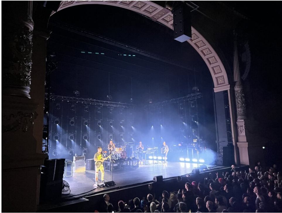
Modern rock band on a classic podium

MUSE delivered a riveting setlist, blending old classics with fresh material, as cool, balanced lighting elevated each song. The intimate theatre setting revealed the band's expressive faces, while the enthralled audience, an unusual sight at Carré, sang and danced along. This unique experience culminated with their harmonica-infused "Knights of Cydonia" finale, leaving everyone in awe.