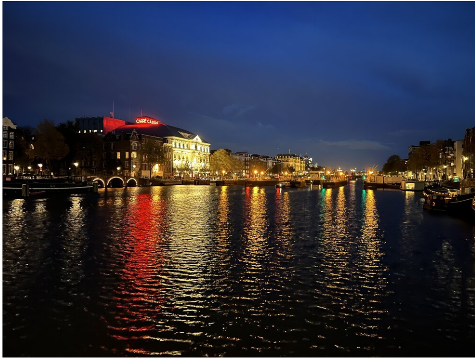
Royal Theatre Carré in Amsterdam by night