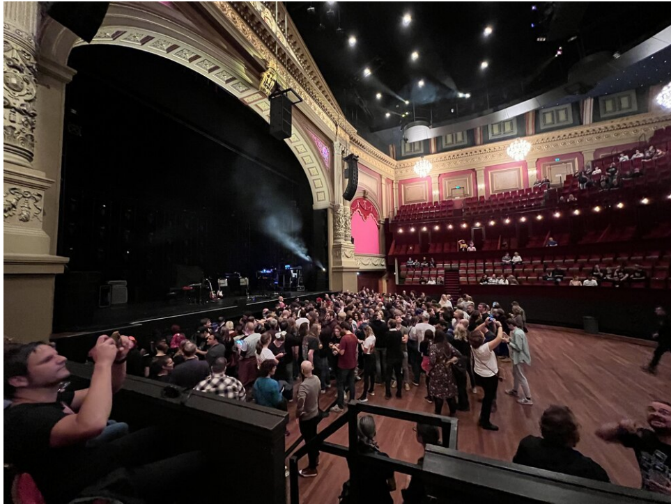
The audience gathering inside the classic theatre