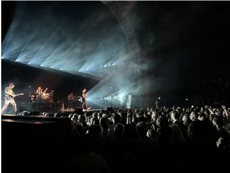
Bellamy rocking the guitar!