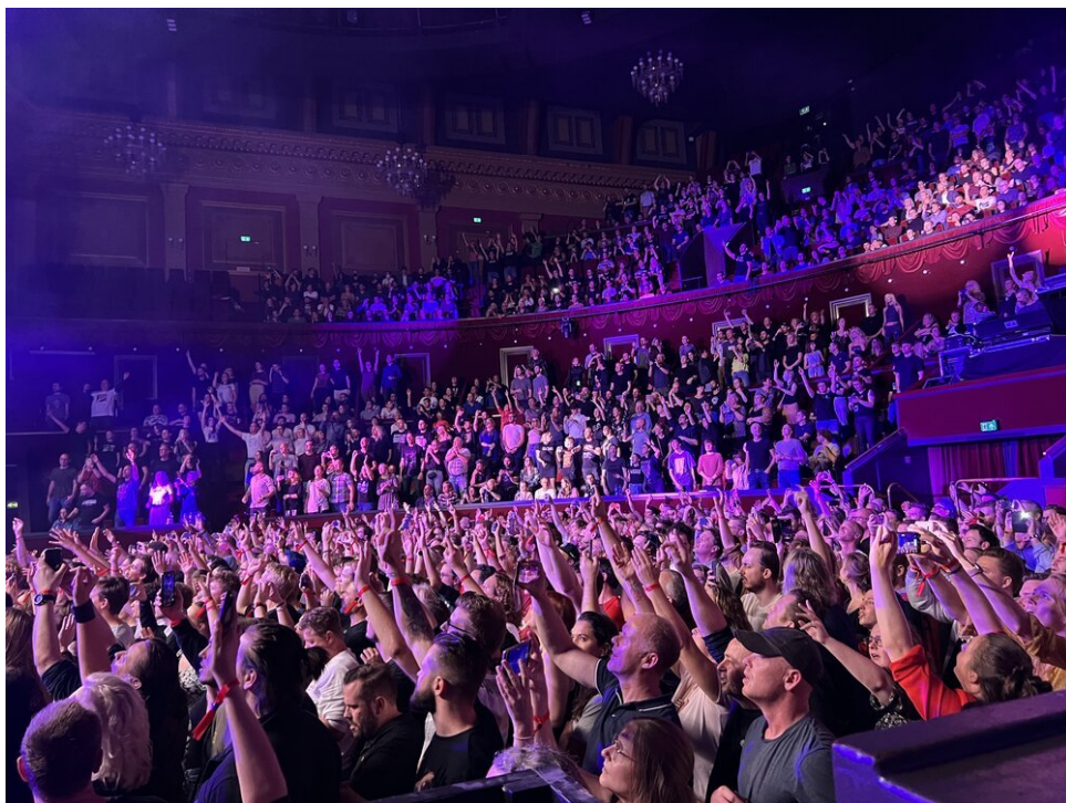
Dancing in Theatre Carré!