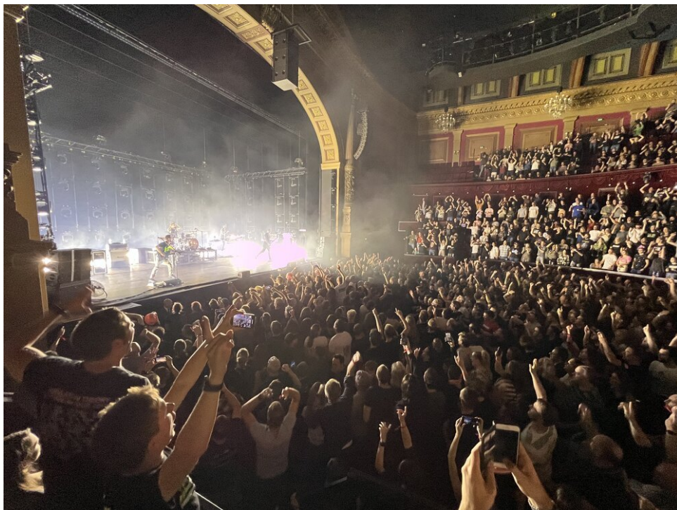
Bright flashes illuminate the audience and shedding light on Carré's classic interior