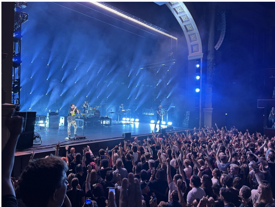
The audience singing along!