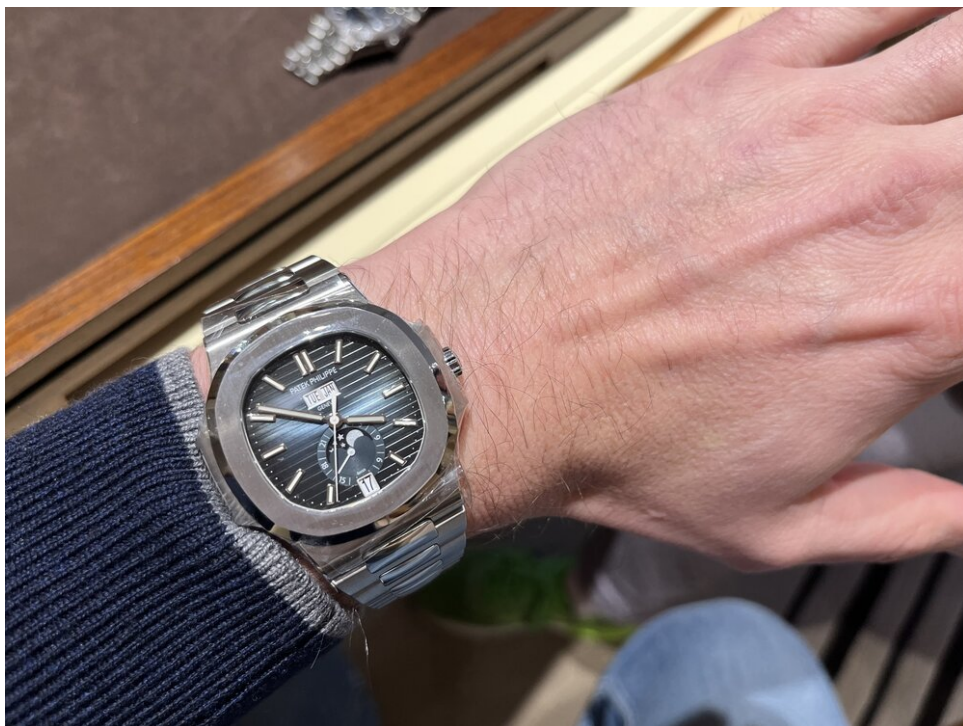
Wearing a Patek Philippe Nautilus annual calendar - the Nautilus was originally crafted by the esteemed watch designer Gerald Genta - an icon