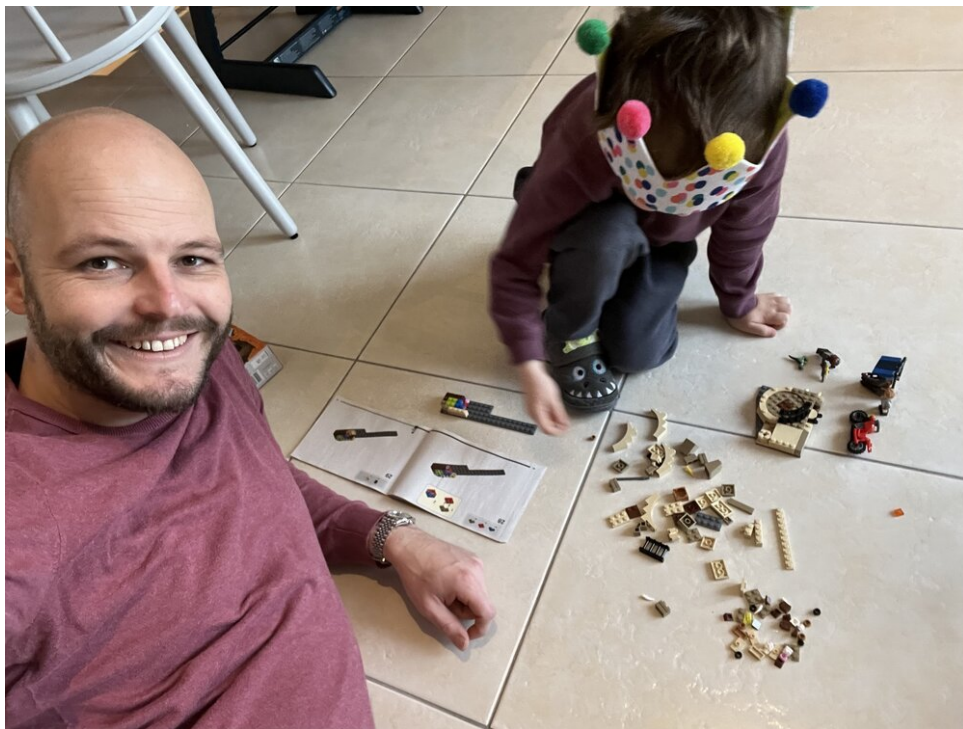
Constructing LEGO on a rock-hard surface? Fear not, this watch won't go to pieces!