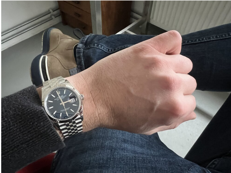
Some might say that the DateJust 36 is the ultimate GADA-watch