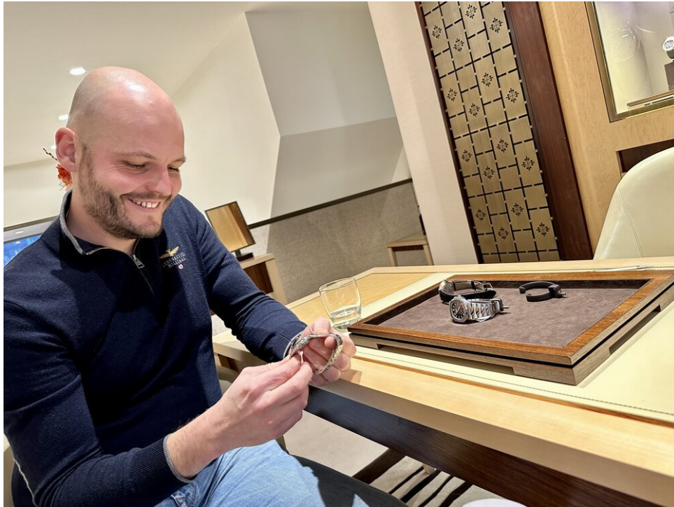
Feeling welcome in the Patek Philippe boutique, which resembles an extraordinary candy shop of unparalleled grandeur