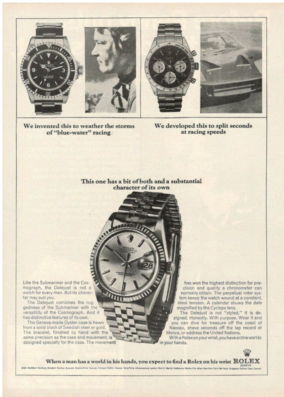
Original Rolex DateJust advertisement from the 1960's

Since its inception in 1945, the Rolex DateJust has secured its position as an iconic timepiece. This classic wristwatch boasts a distinct design that transcends fleeting trends, with its elegant form and timeless appeal. As the first self-winding wristwatch to feature an automatically changing date on the dial, the DateJust demonstrated Rolex's commitment to innovation and precision. Over the years, this masterpiece has seen various refinements, yet it retains its original charm and enduring allure.